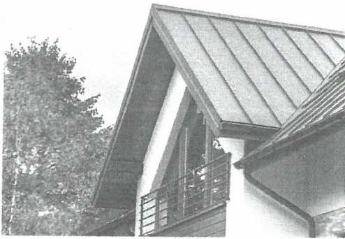
Standing seam roofing system