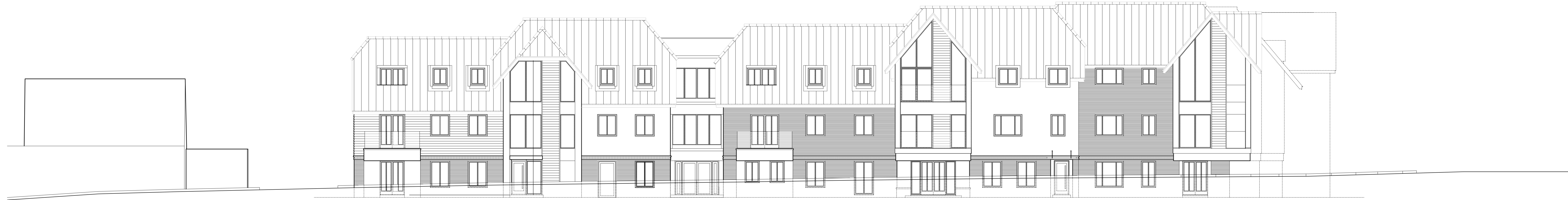
WEST FACING ELEVATION - STREET SCENE ALONG KENNETH ROAD