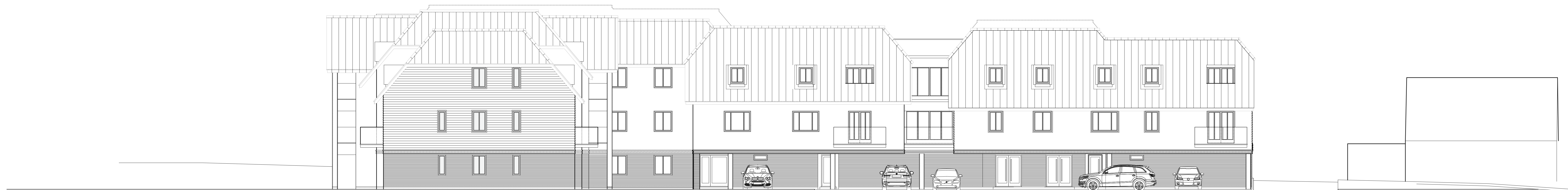
EAST FACING ELEVATION