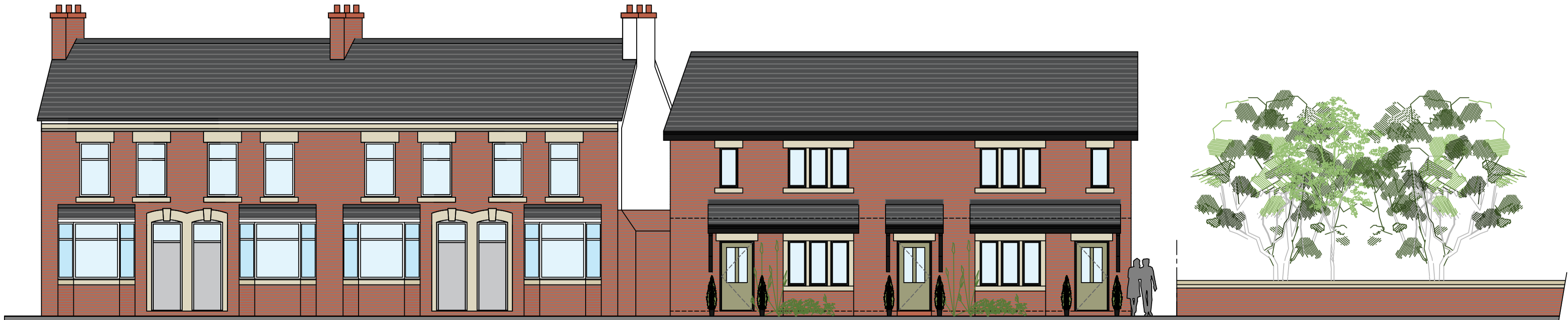
1:100 STREET SCENE ELEVATION TO EAVES LANE