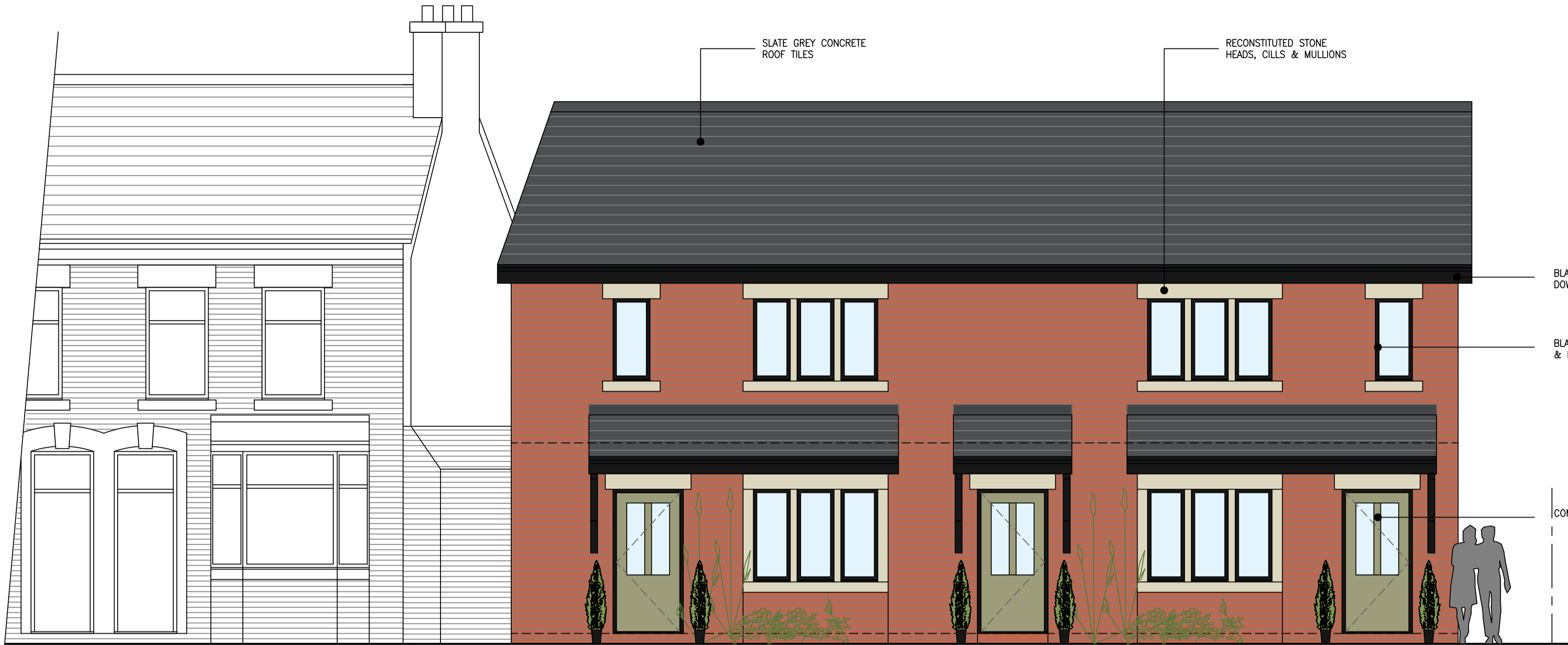
1:50 PROPOSED FRONT ELEVATION TO EAVES LANE (Facing West)