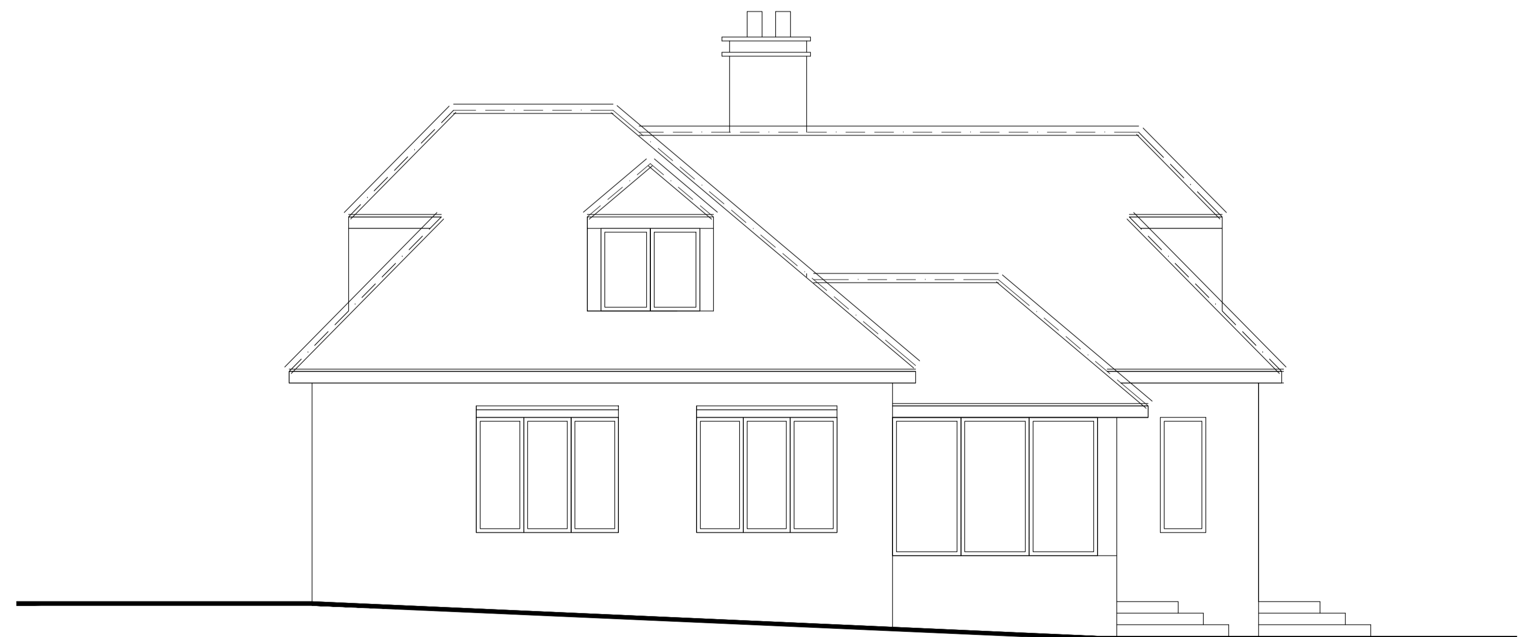
EXISTING MAIN HOUSE RIGHT SIDE ELEVATION.