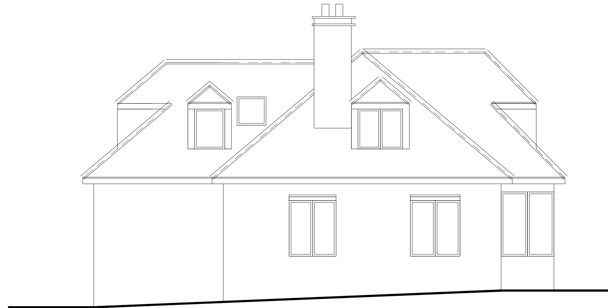
EXISTING MAIN HOUSE LEFT SIDE ELEVATION.