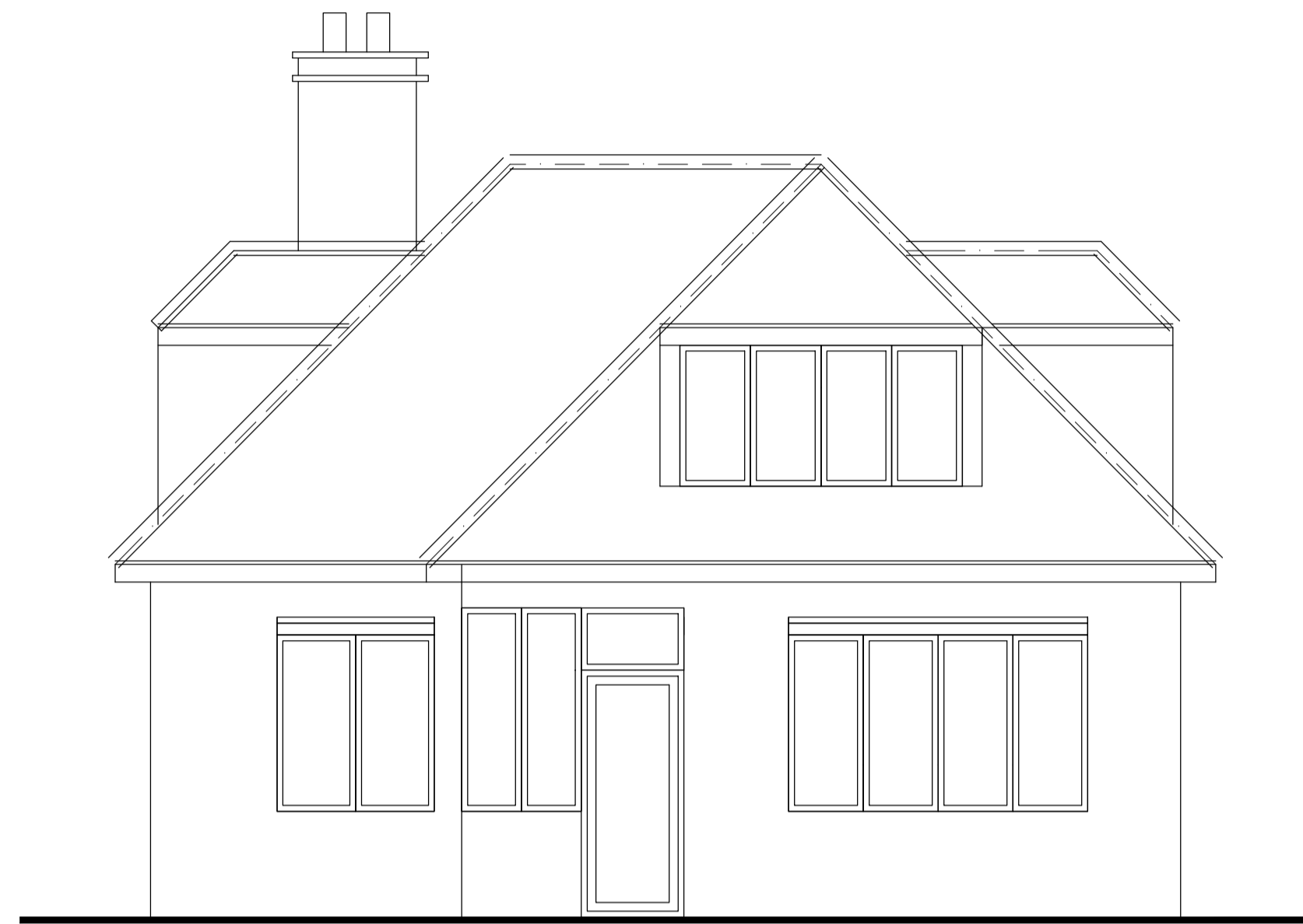
EXISTING MAIN HOUSE FRONT ELEVATION.