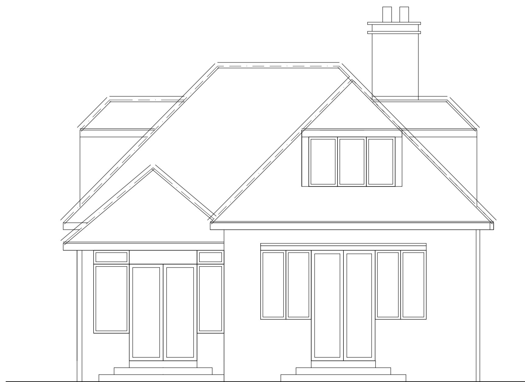
EXISTING MAIN HOUSE REAR ELEVATION.