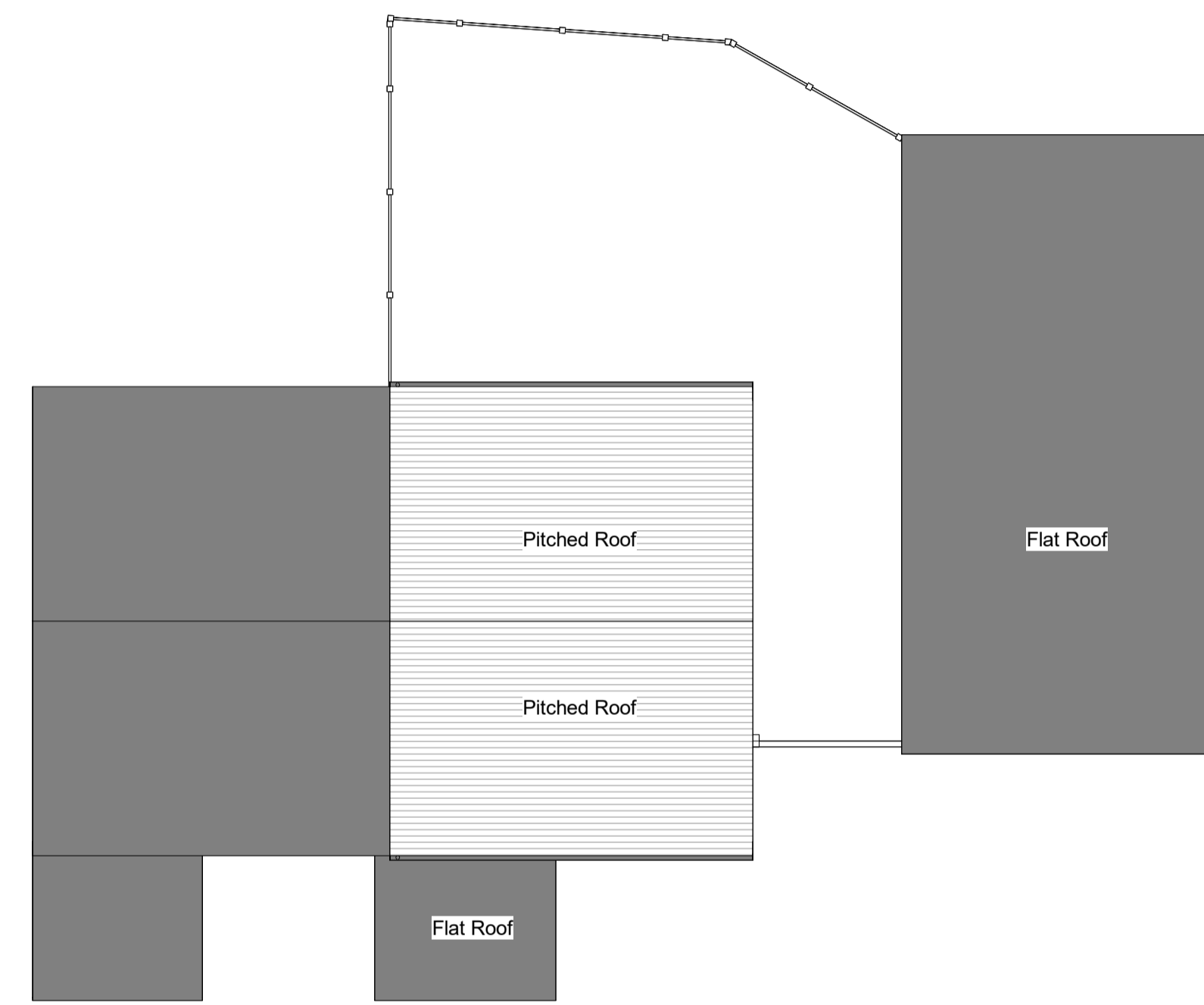
02 Existing Roof Plan 1 : 100