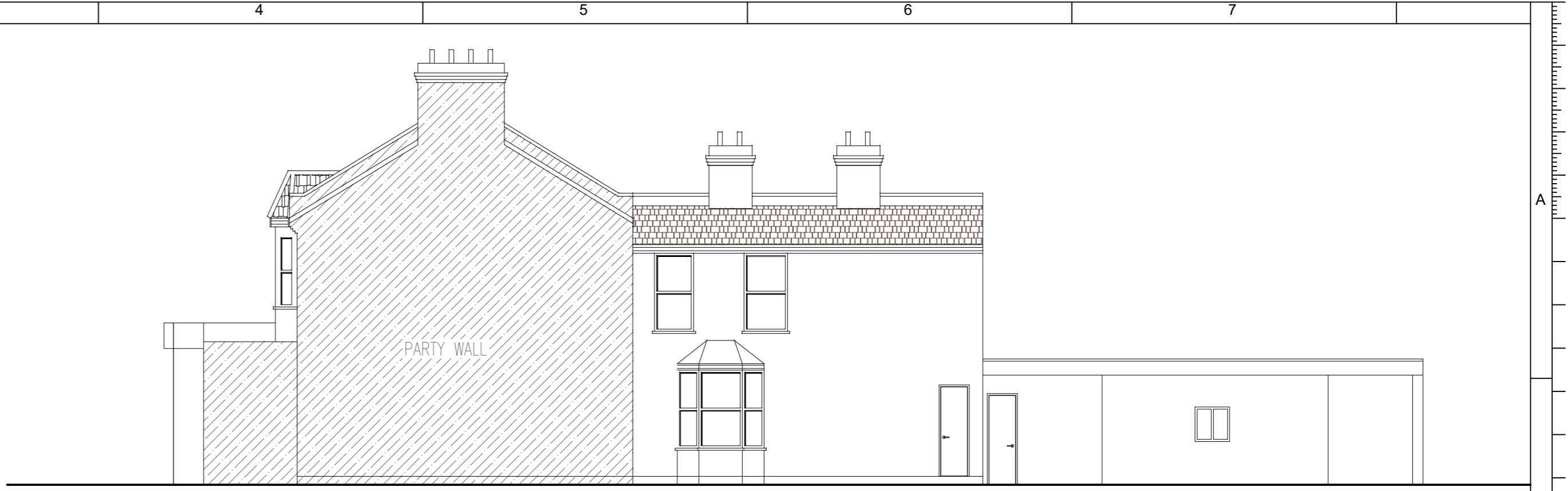
SIDE (FLANK) ELEVATION scale 1:100