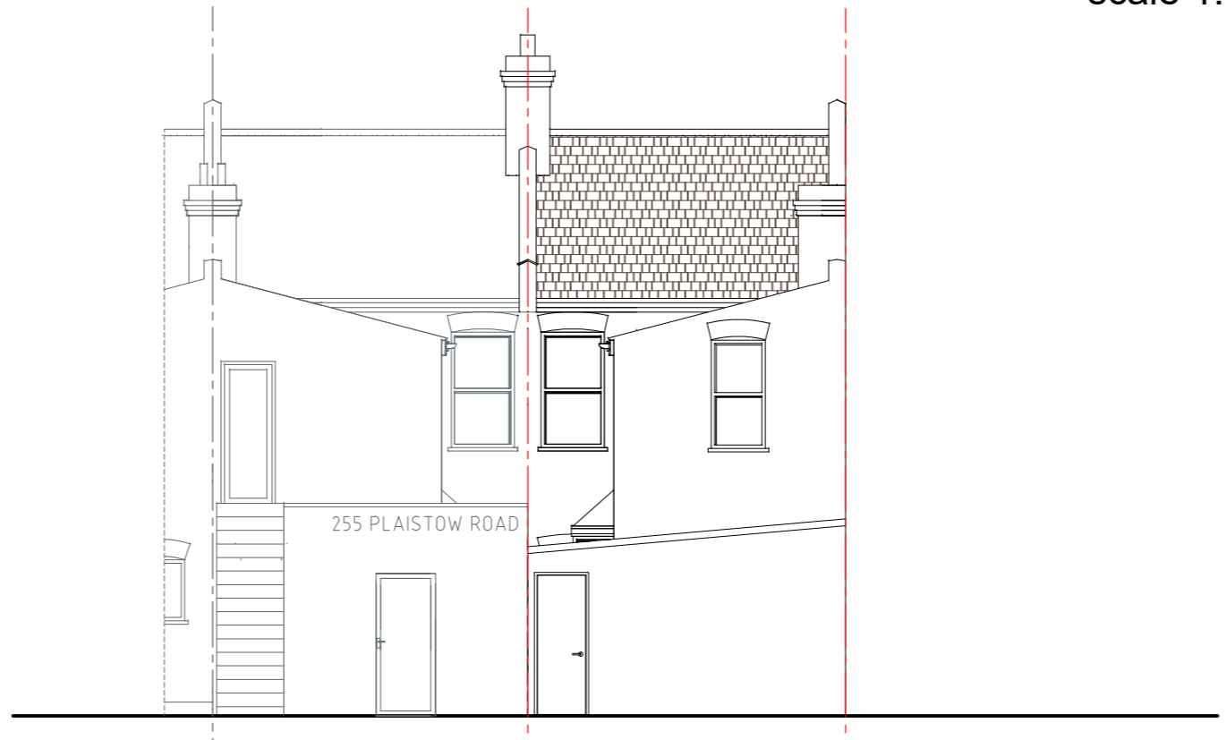
REAR ELEVATION scale 1:100

Do not scale off this drawing. If no dimension is given, we take no responsibility for any dimension obtained by measuring or scaling from this drawing. This drawing is the property of Maplin Studio. It is copyright protected and is not to be reproduced, disclosed or copied without written permission.