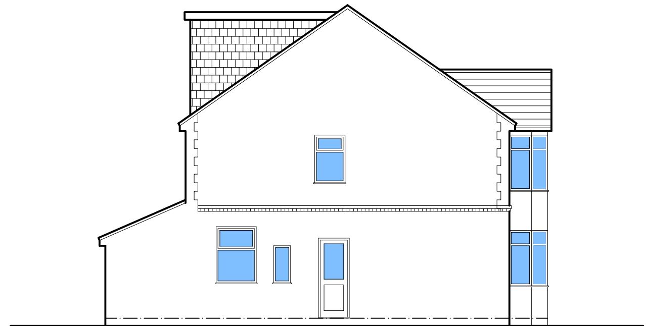
existing side elevation