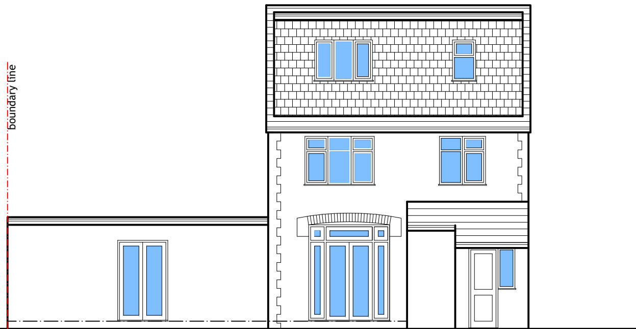
existing rear elevation