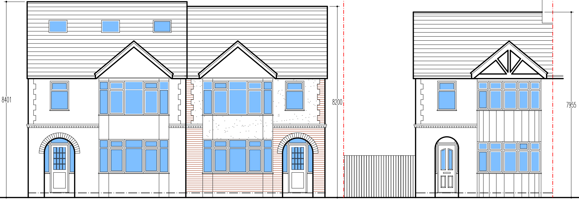
proposed street view