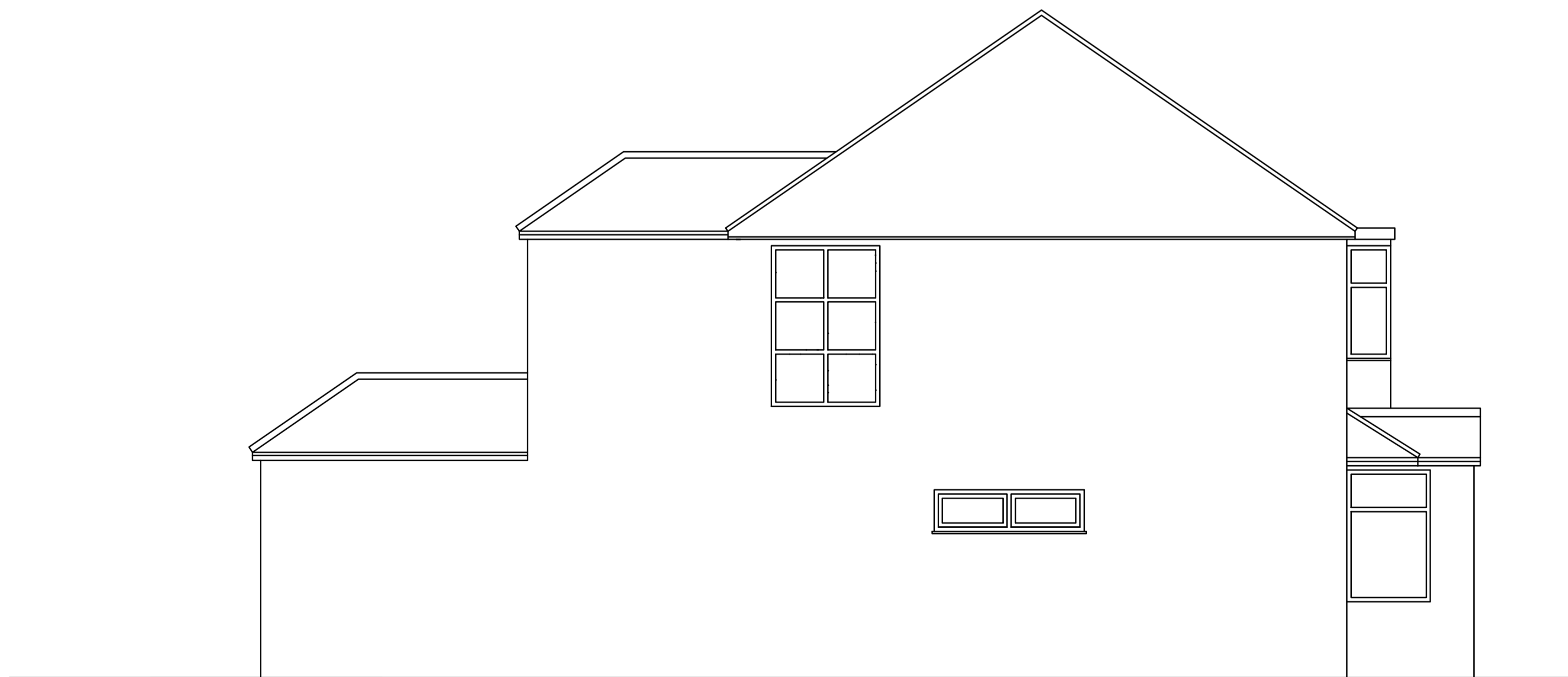
EXISTING SIDE ELEVATION (B)