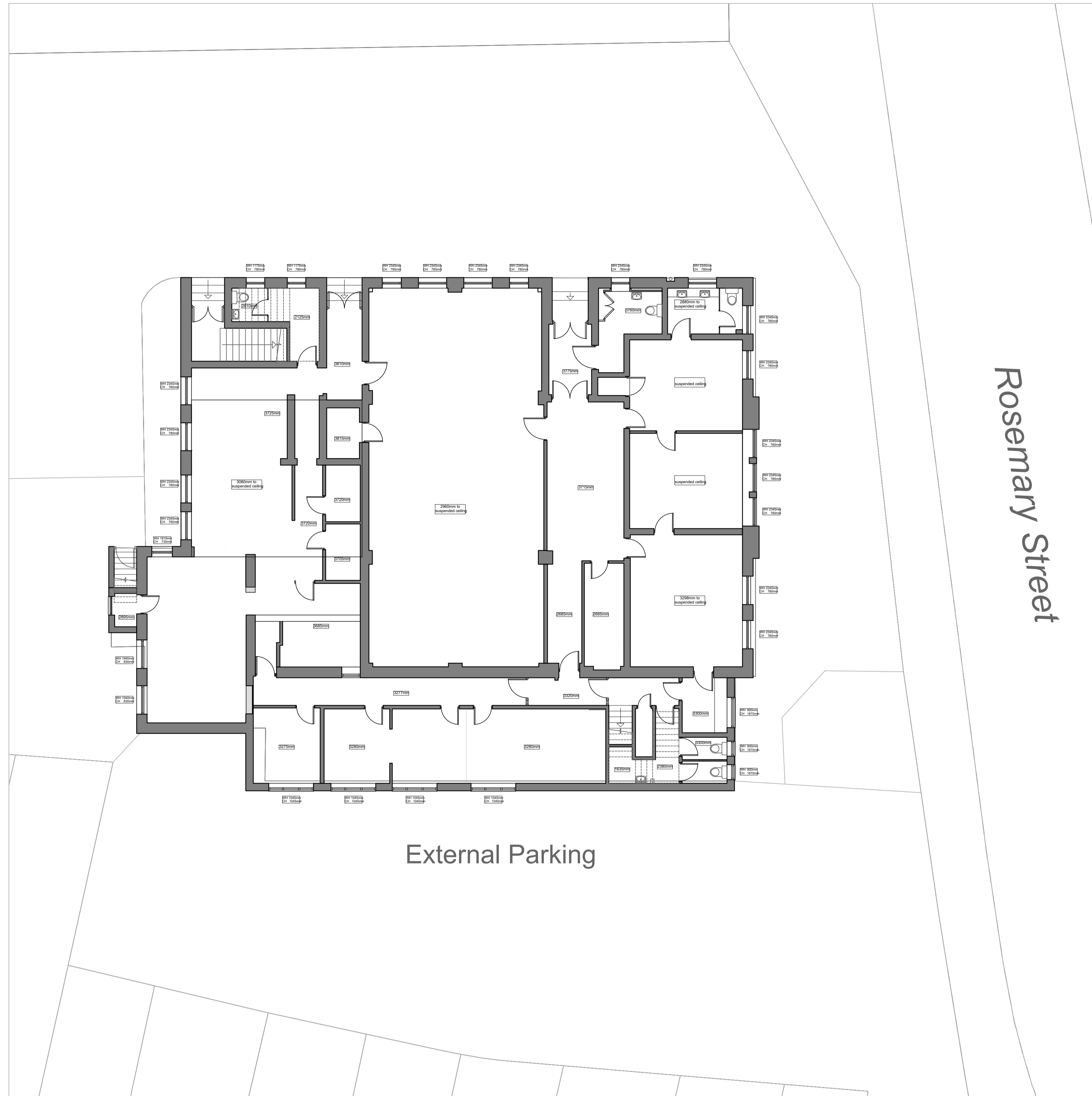
Existing Ground Floor GA Plan 1:100 at A1