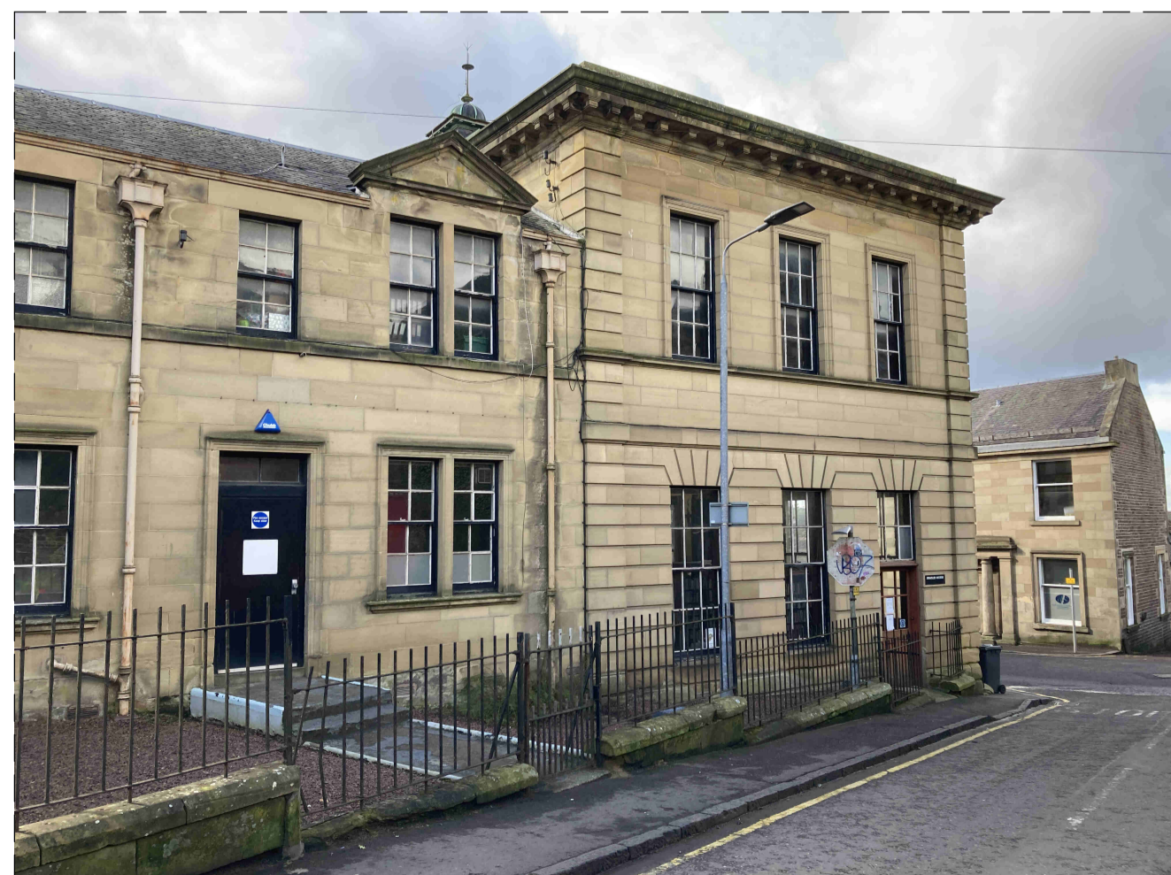
Existing Black & White Windows Externally

Replacement timber should match the existing as closely as possible.