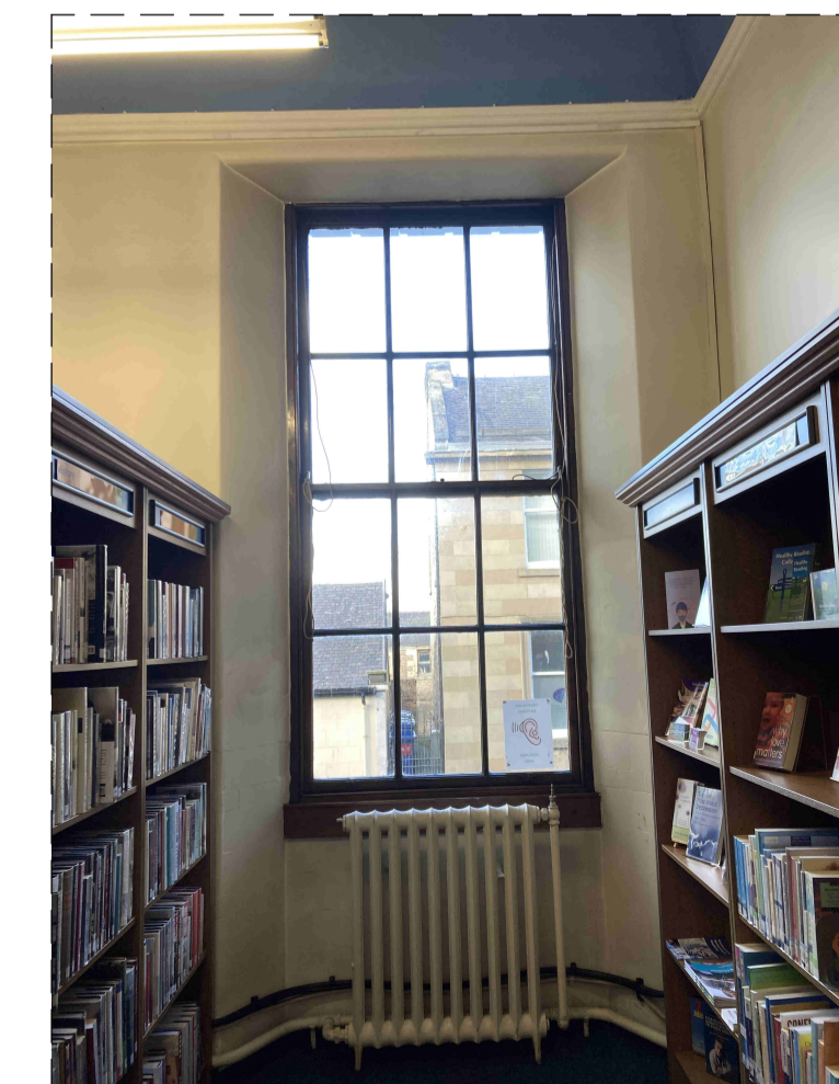
Existing Brown Window At Library