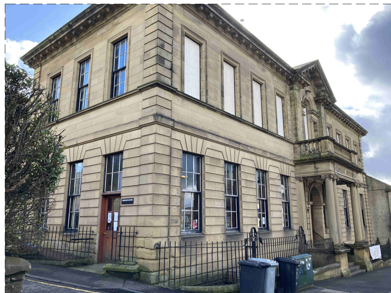
Existing Black & White Windows Externally