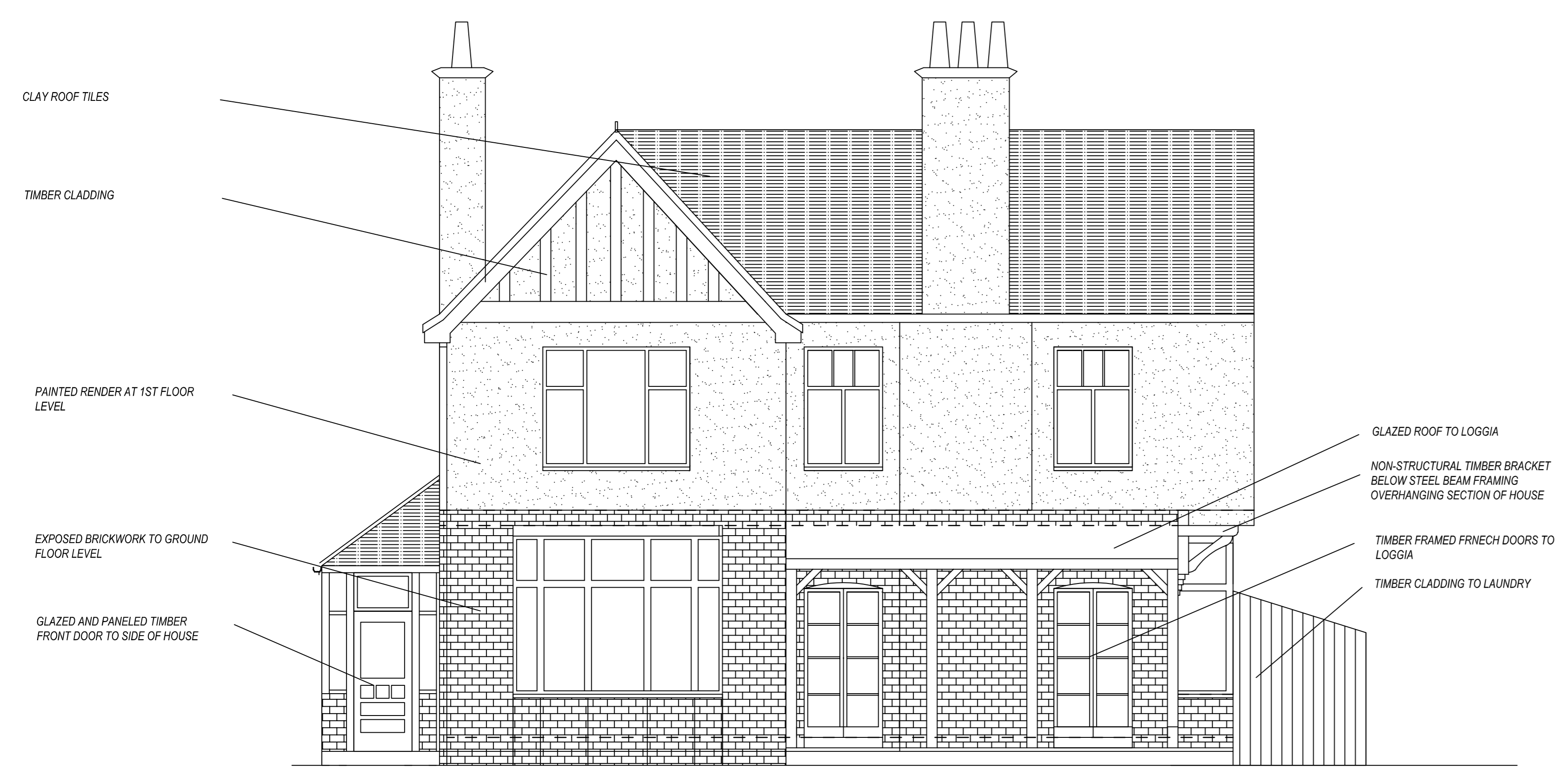
EXISTING EAST (FRONT) ELEVATION