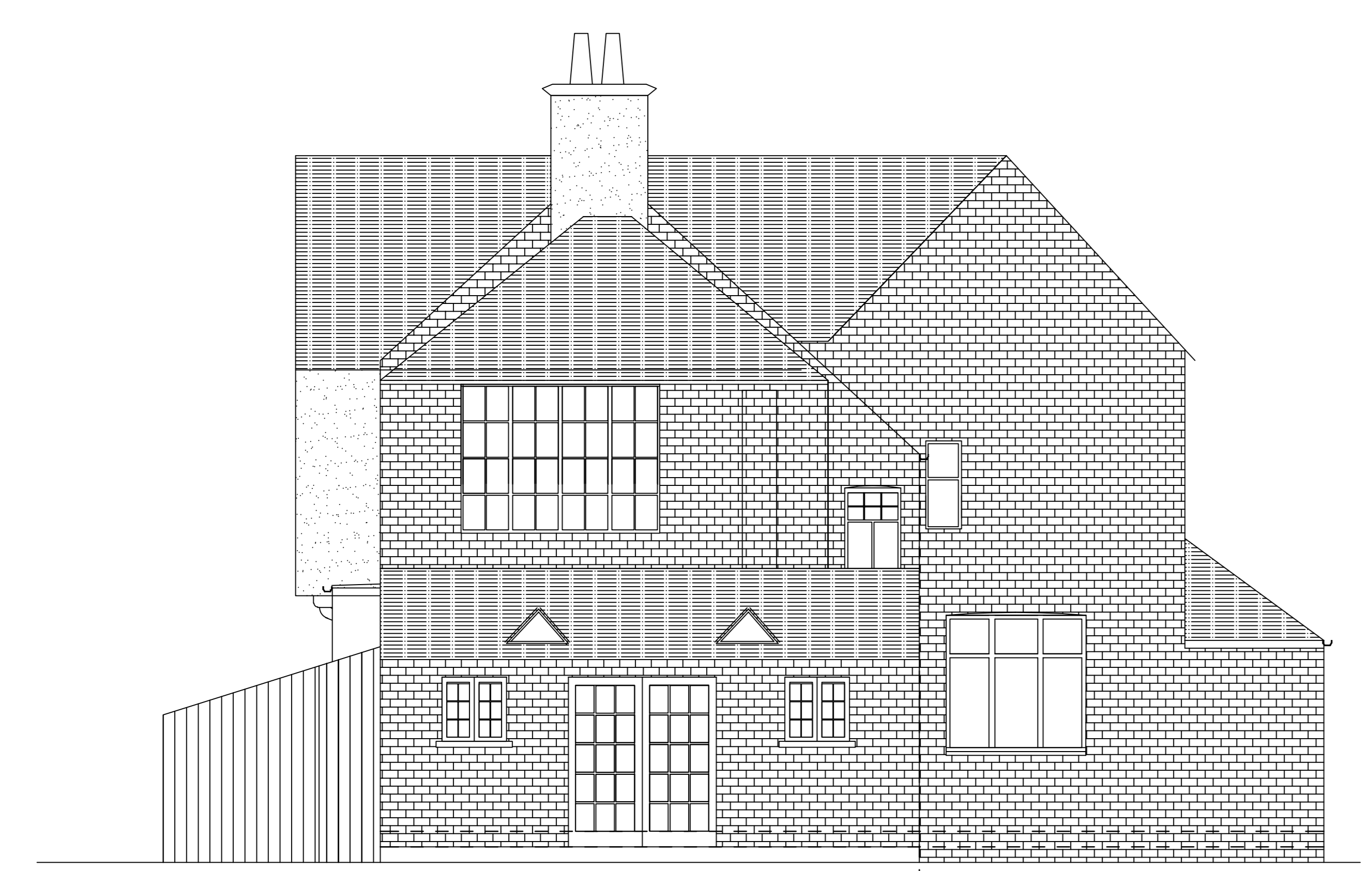
EXISTING WEST (REAR) ELEVATION