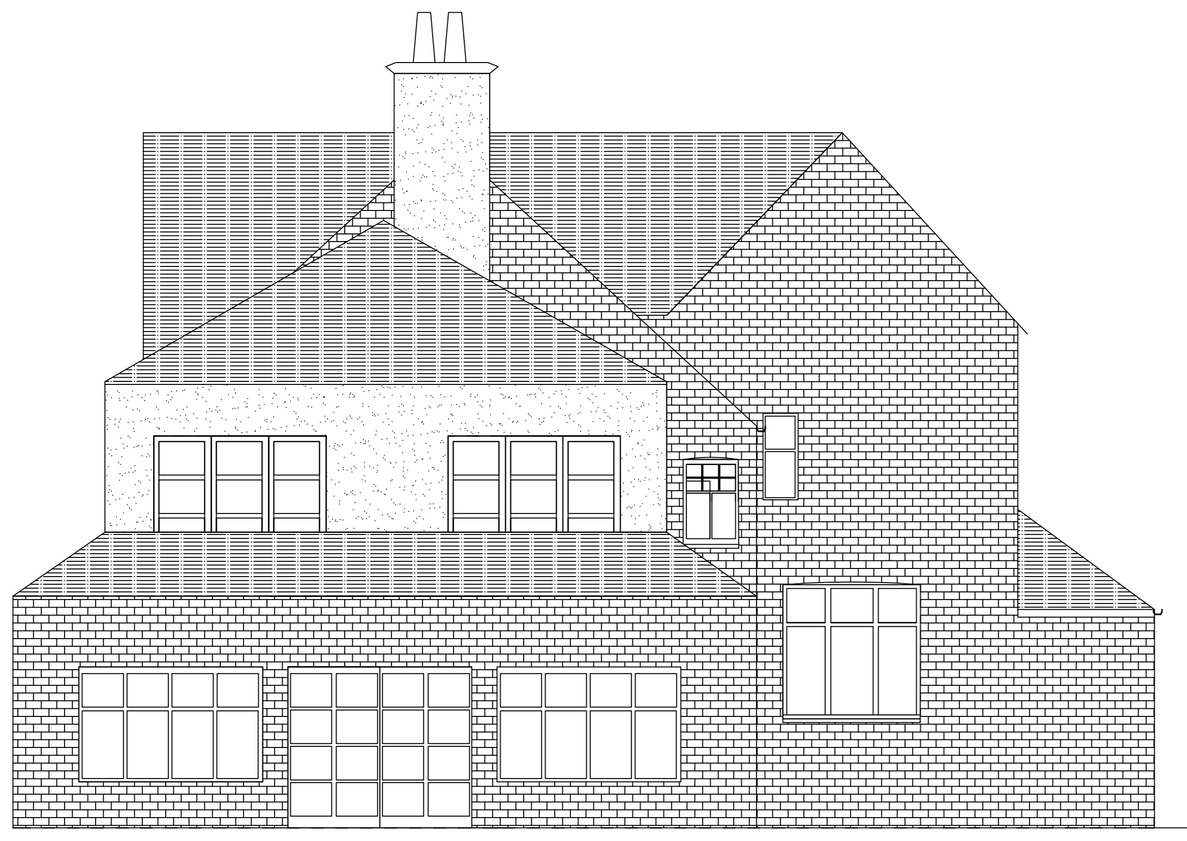
PROPOSED WEST (REAR) ELEVATION