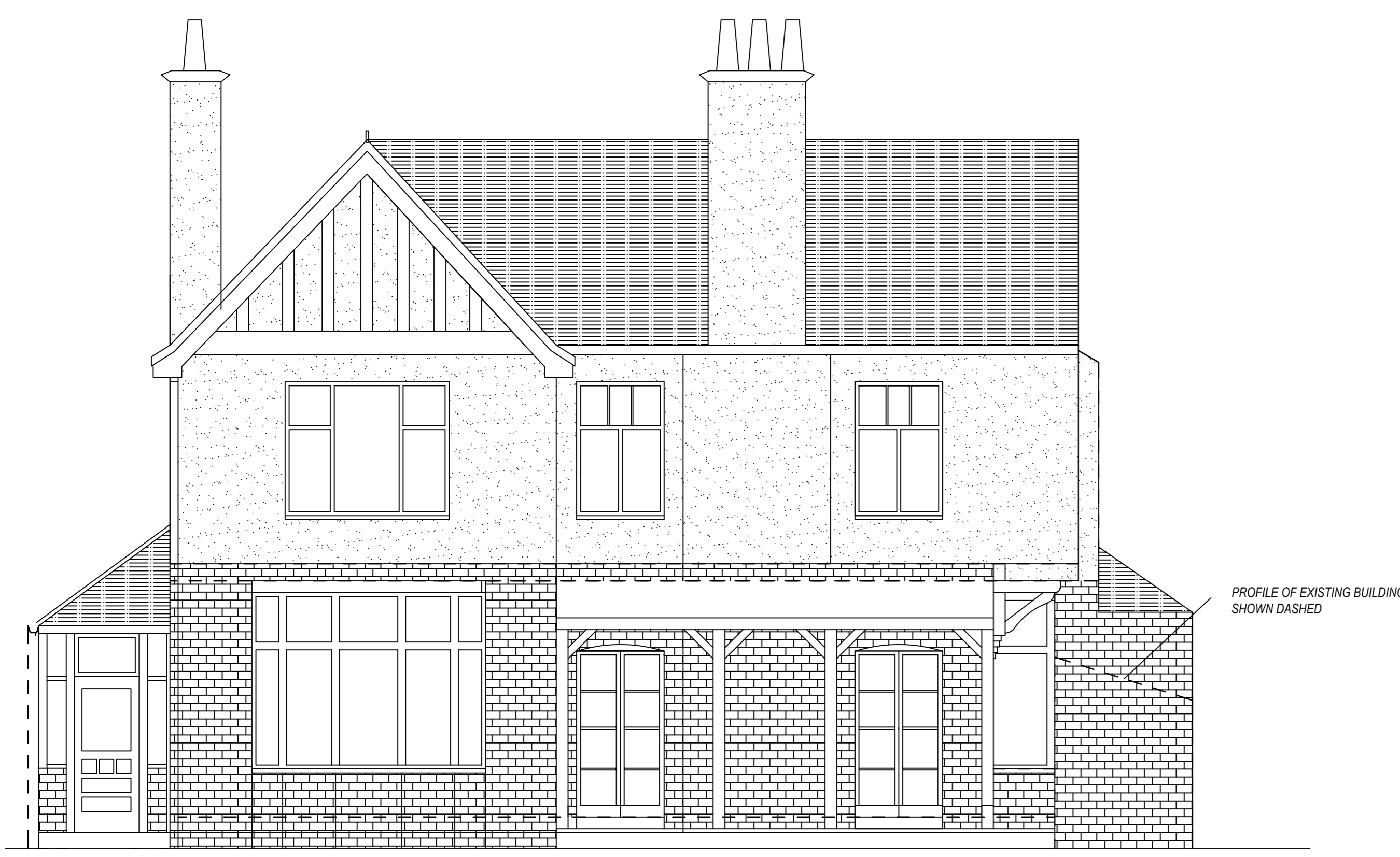
PROPOSED EAST (FRONT) ELEVATION