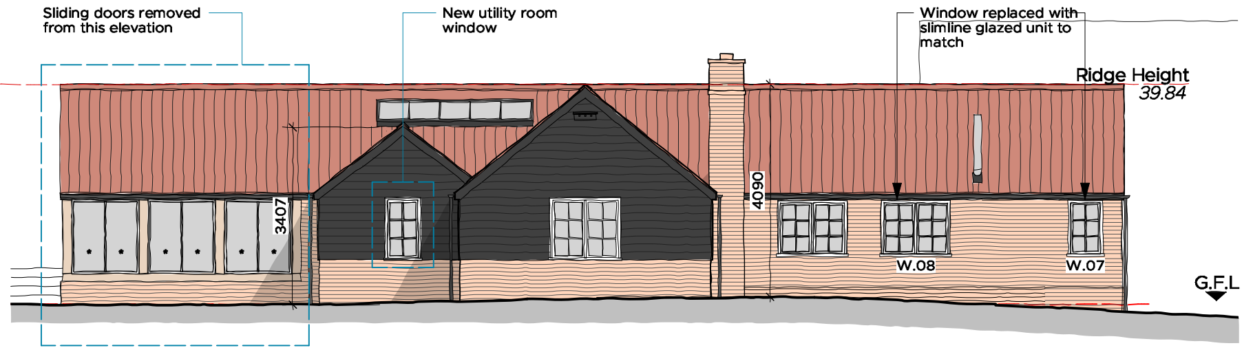
Proposed Side Elevation North West