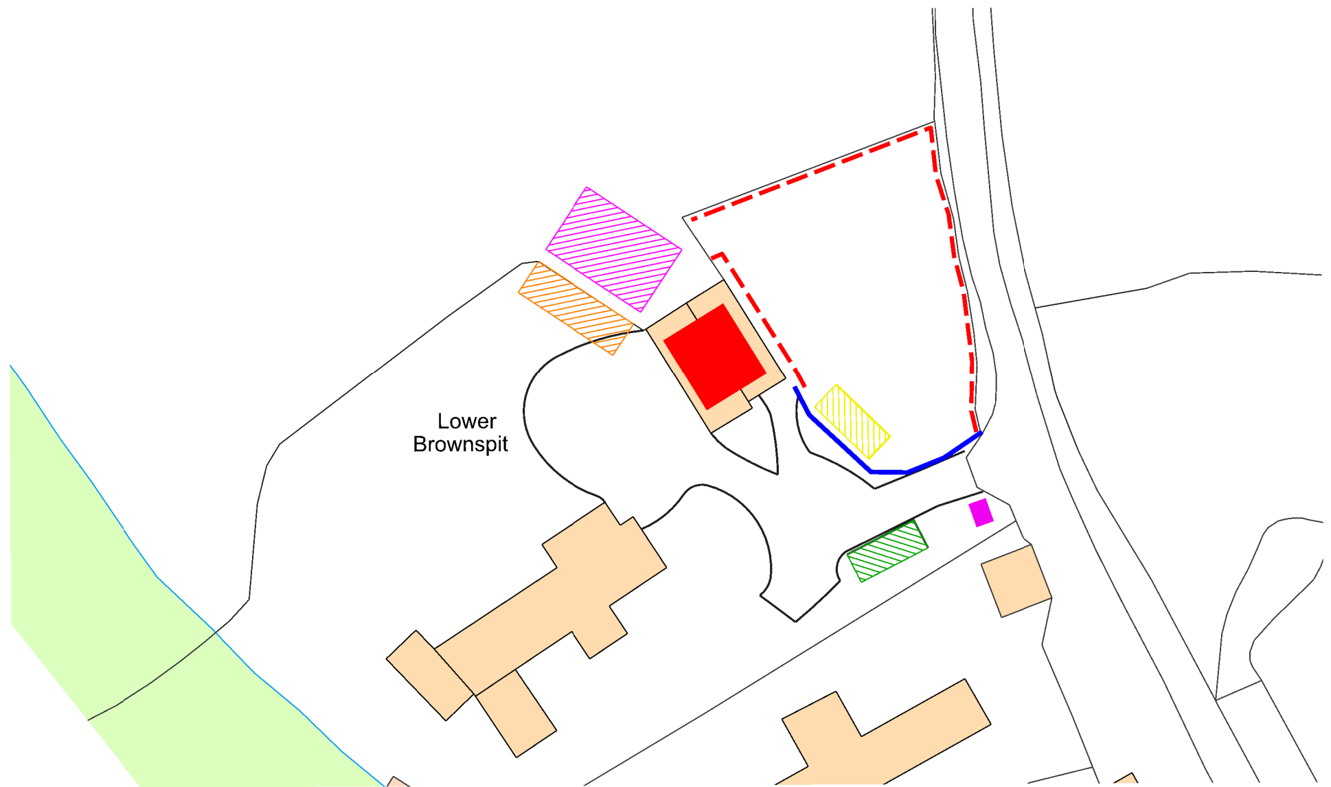
CEMP Site Plan