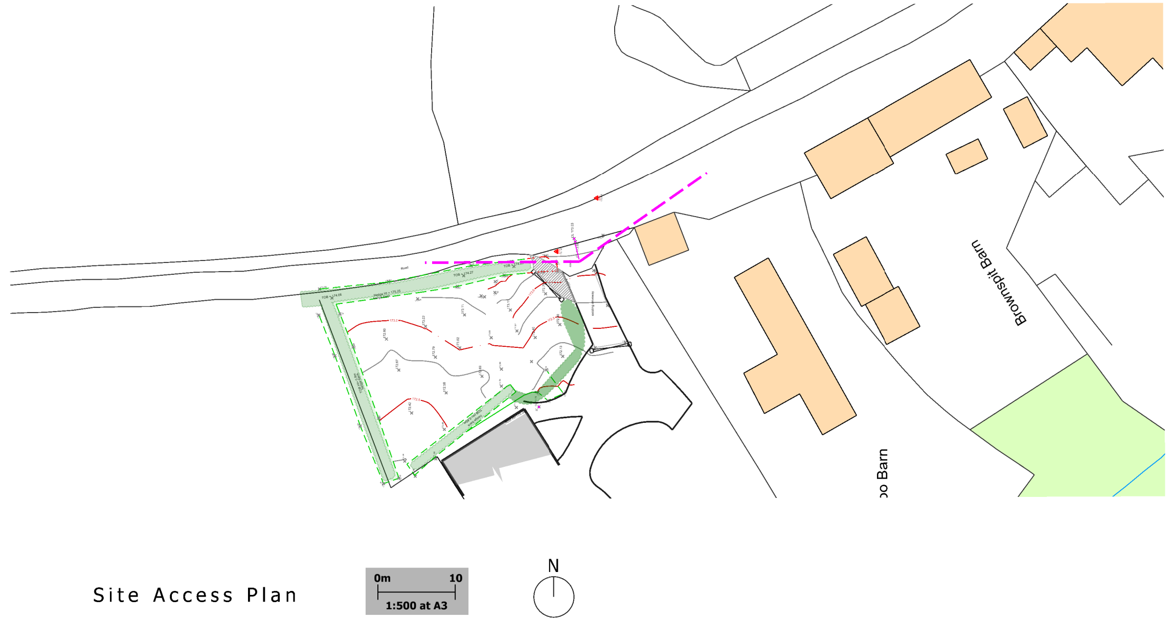
Site Access Plan