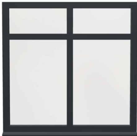
Grey Aluminium windows