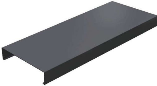
Grey Aluminium capping