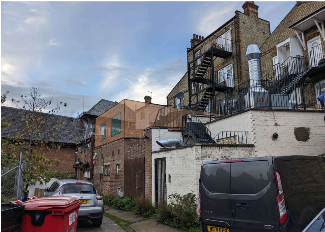
View of the rear of the property with rear extension indicated for scale.