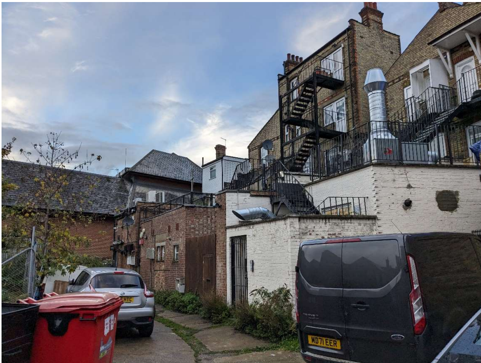
View of the rear from the service road