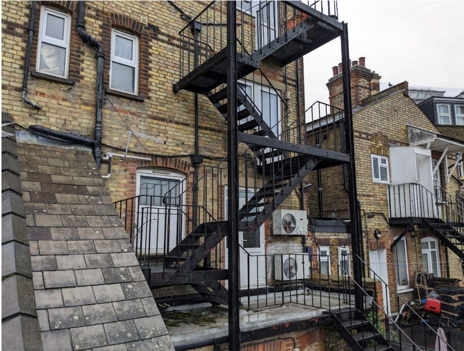
View of rear escape and roof over internal staircase