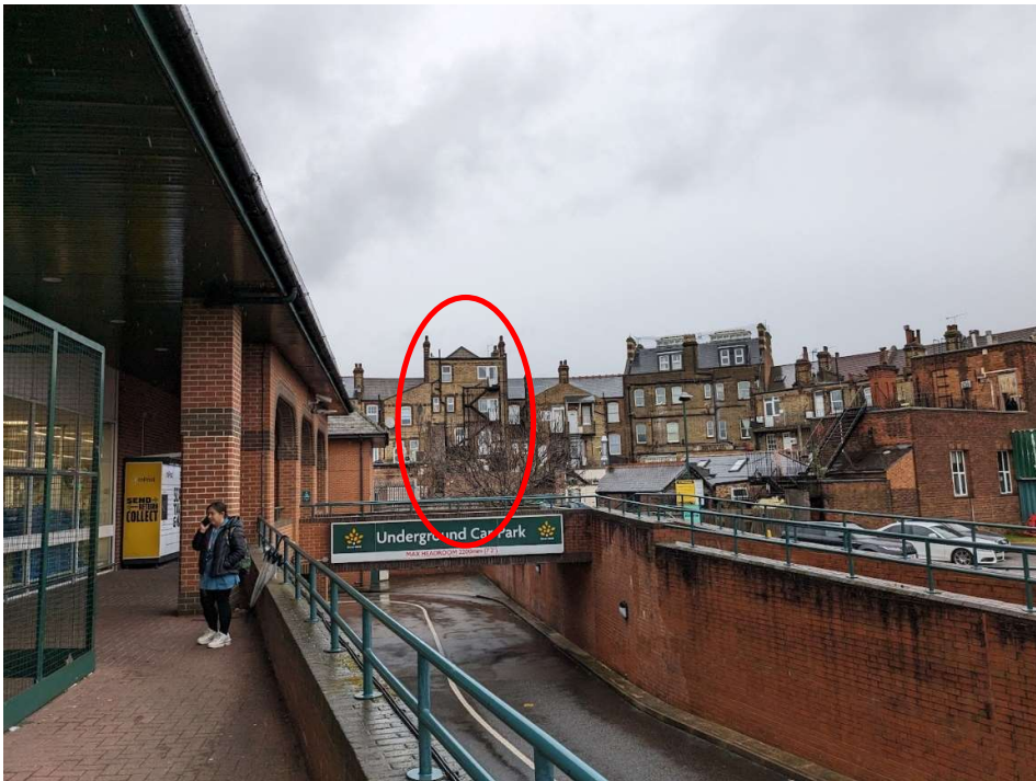
View of the rear of the property from the Morrisons service road