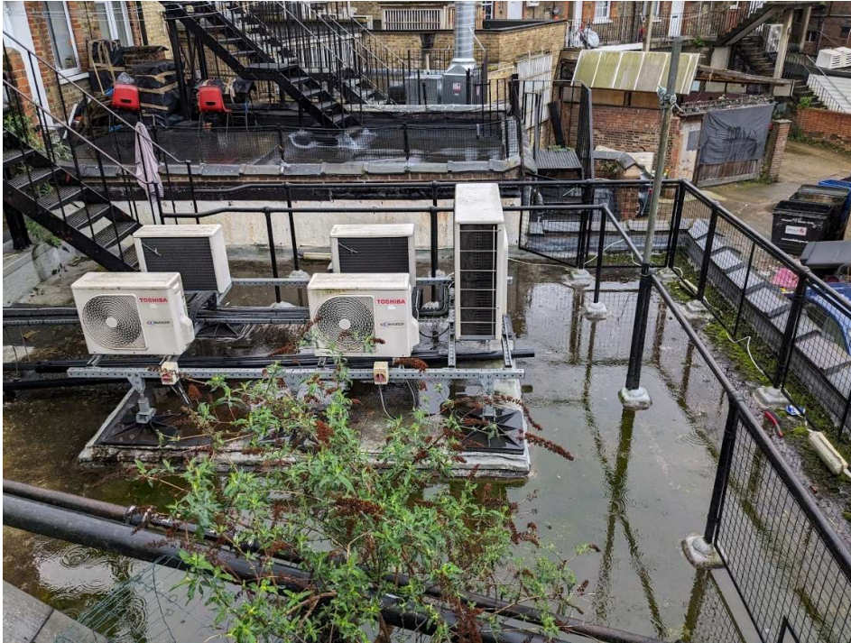
View of existing roof and plant