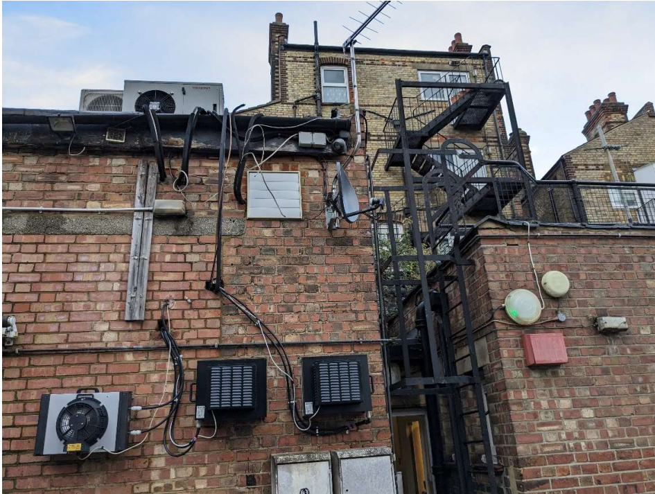
View of the rear and adjacent property (no. 9)