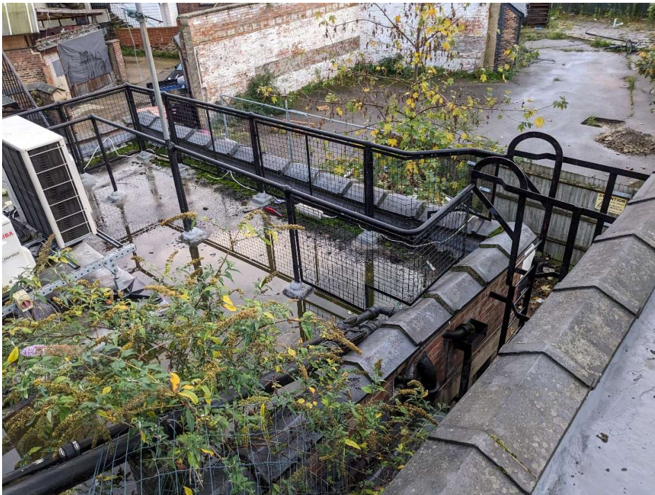
View of existing rear roof and escape route