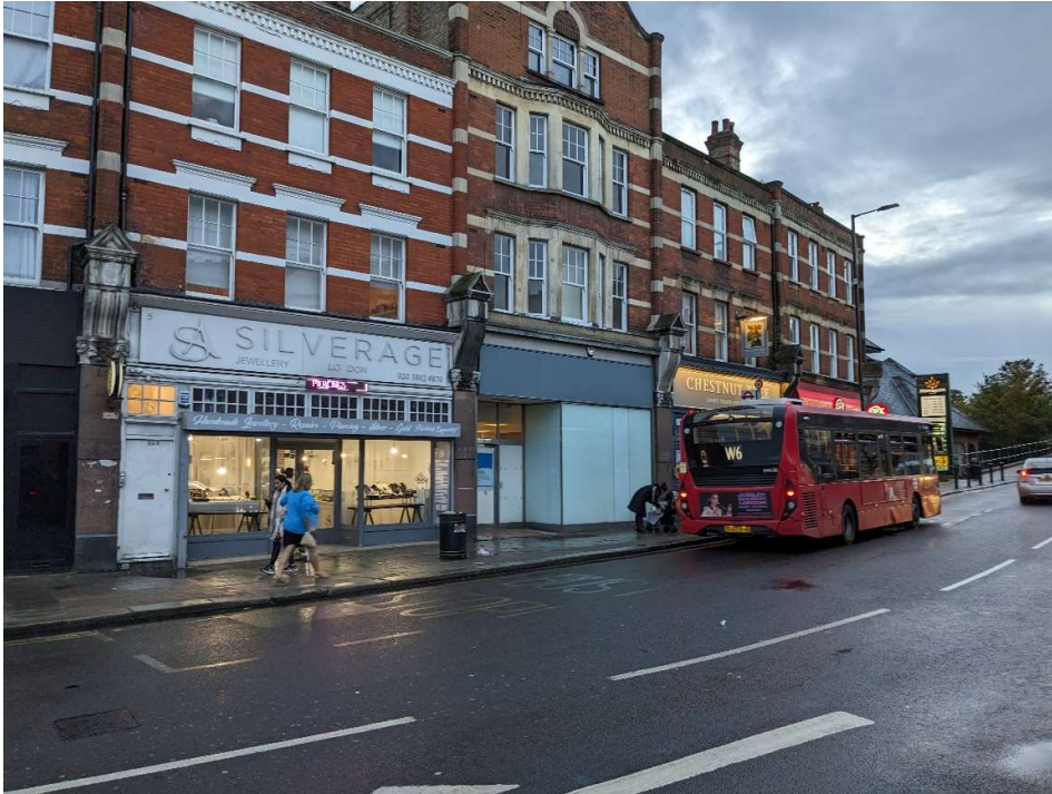
View of front of the property