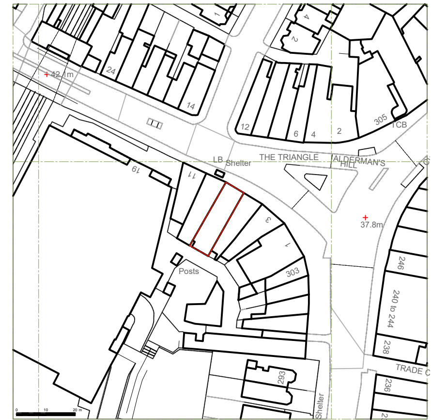
LOCATION PLAN scale 1:1250 @A3

NOTE THIS DRAWING IS TO BE READ IN CONJUNCTION WITH ALL OTHER RELEVANT DRAWINGS AND SPECIFICATIONS THIS DRAWING HAS BEEN PREPARED FOR IDENTIFICATION PURPOSES ONLY. VERIFICATION OF DRAWN INFORMATION TO BE CARRIED OUT BY CONTRACTOR PRIOR TO OTHER USE.