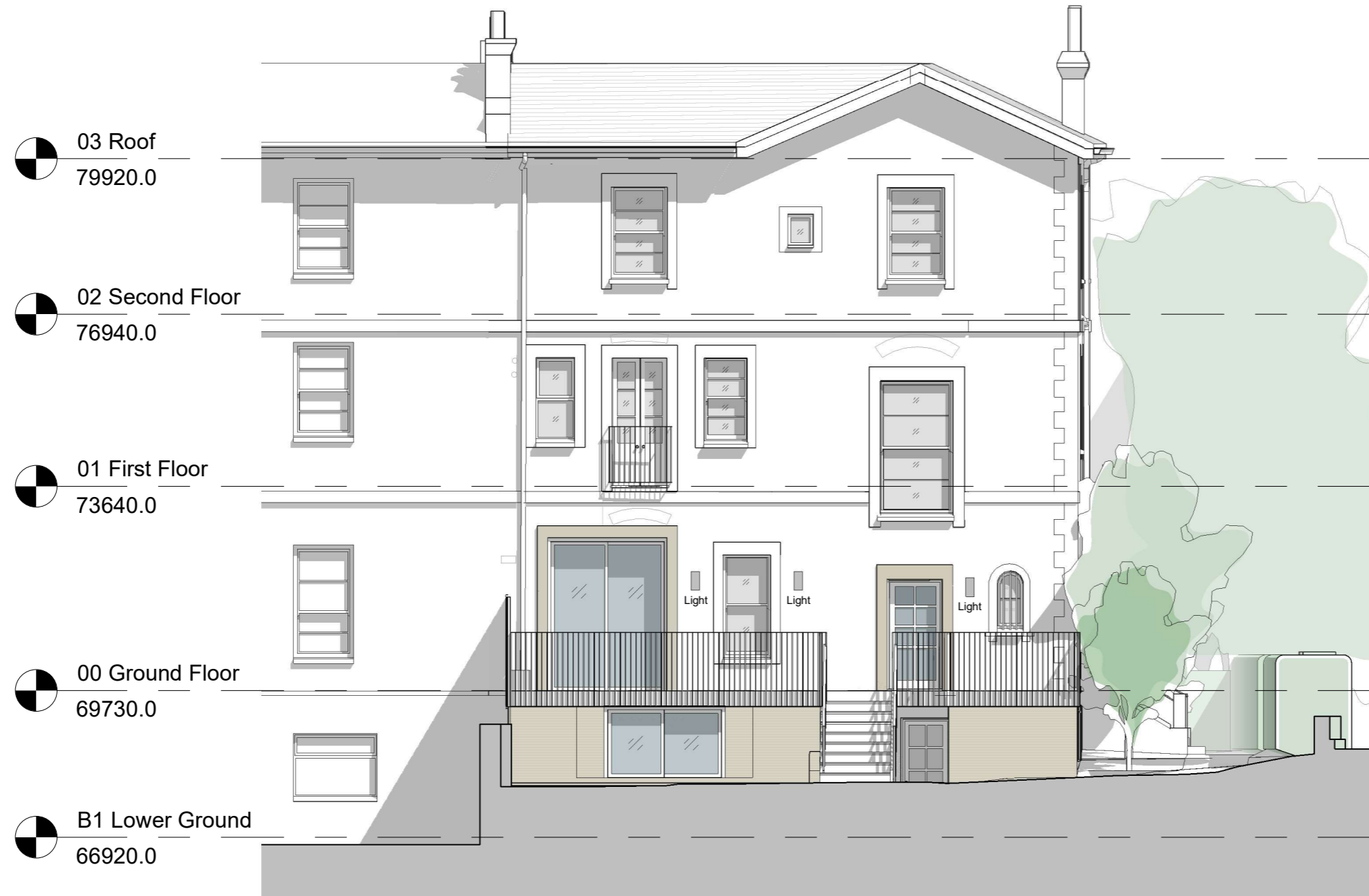
Proposed Rear Elevation 1 : 100