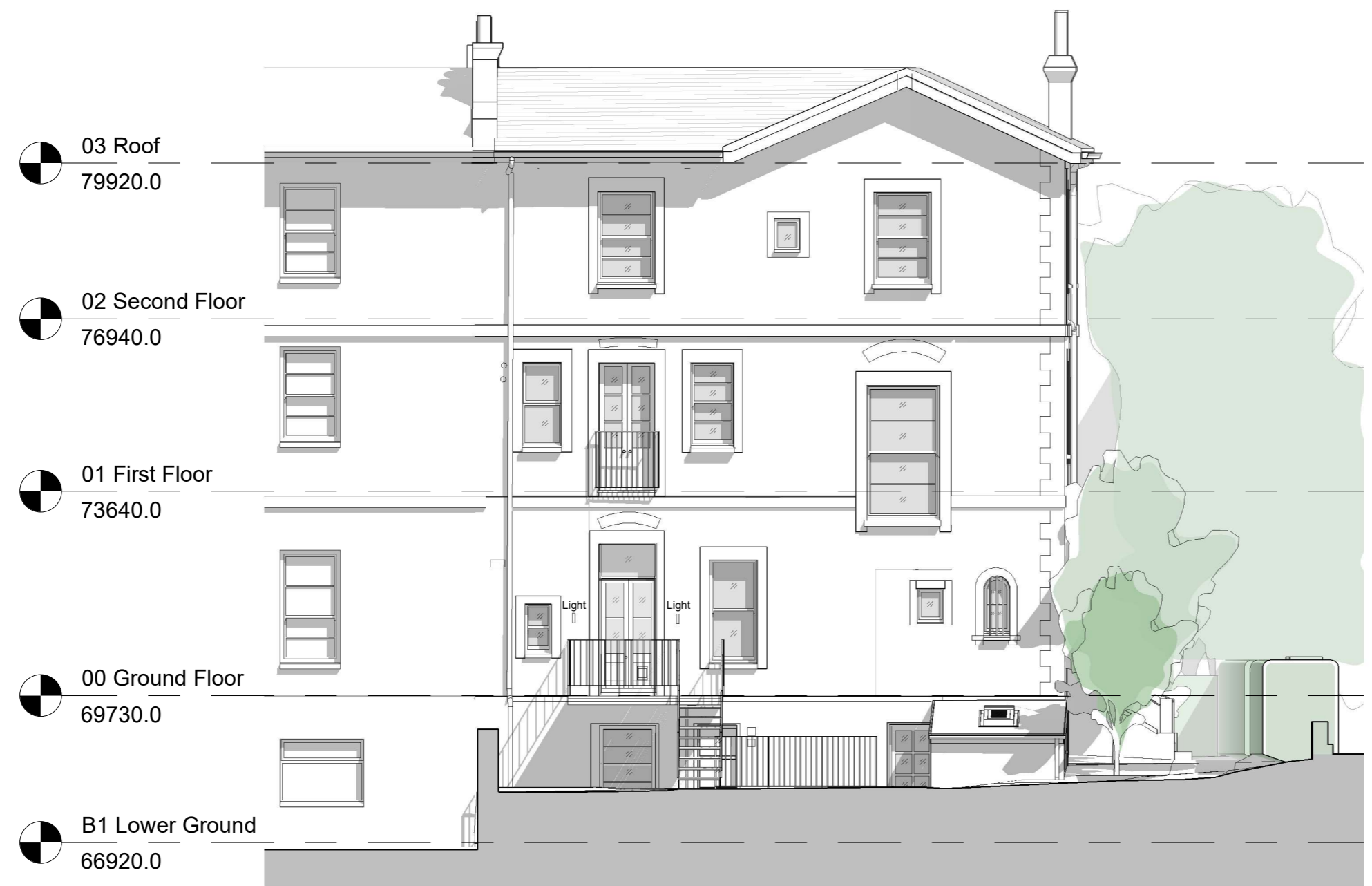
Existing Rear Elevation 1 : 100