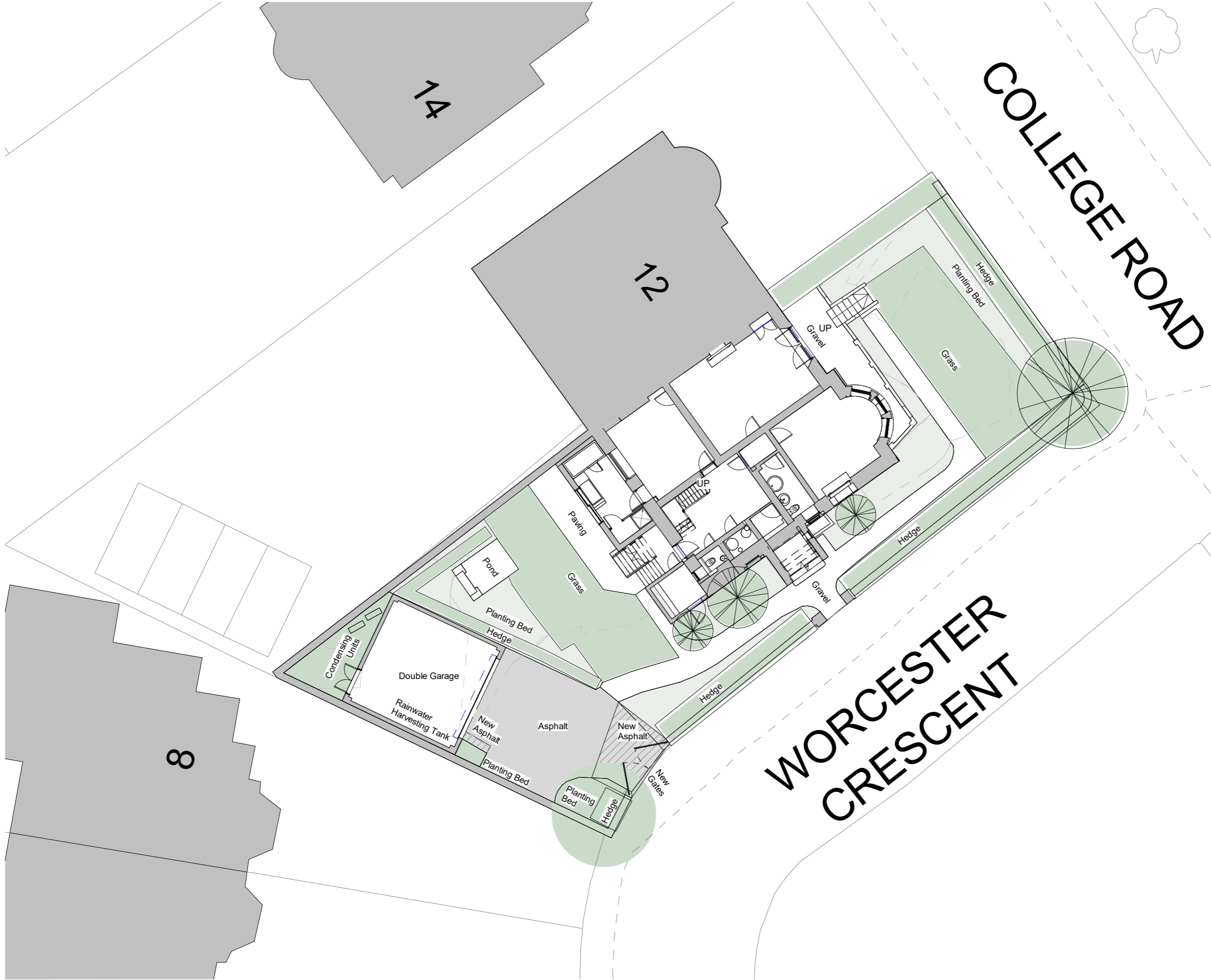
Block Plan / Site Layout 1 : 200

Notes This drawing may be scaled for the purposes of Planning Applications, Land Registry and for Legal plans where the scale bar is used, and where it verifies that the drawing is an original or an accurate copy. It may not be scaled for construction purposes. Always refer to figured dimensions. All dimensions are to be checked on site. Discrepancies and/or ambiguities between this drawing and information given elsewhere must be reported immediately to this office for clarification before proceeding. All drawings are to be read in conjunction with the specification and all works to be carried out in accordance with latest British Standards / Codes of Practice.