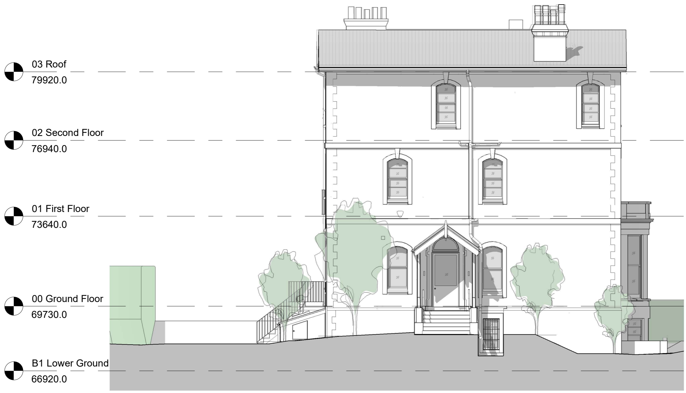
Existing Side Elevation 1 : 100