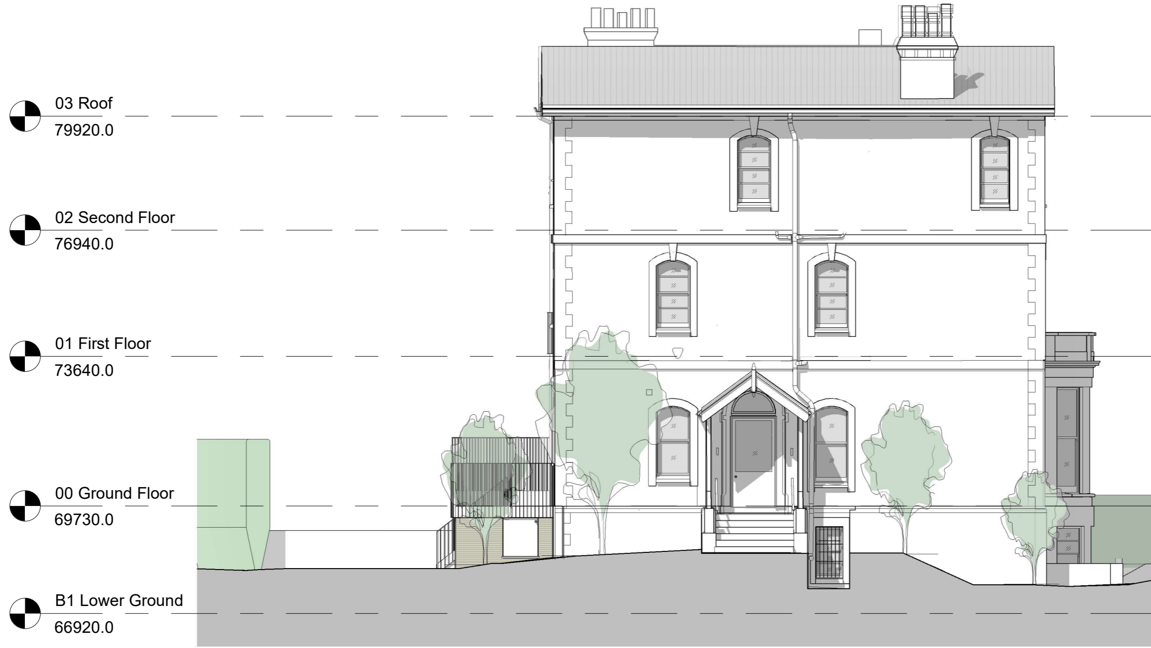
Proposed Side Elevation 1 : 100