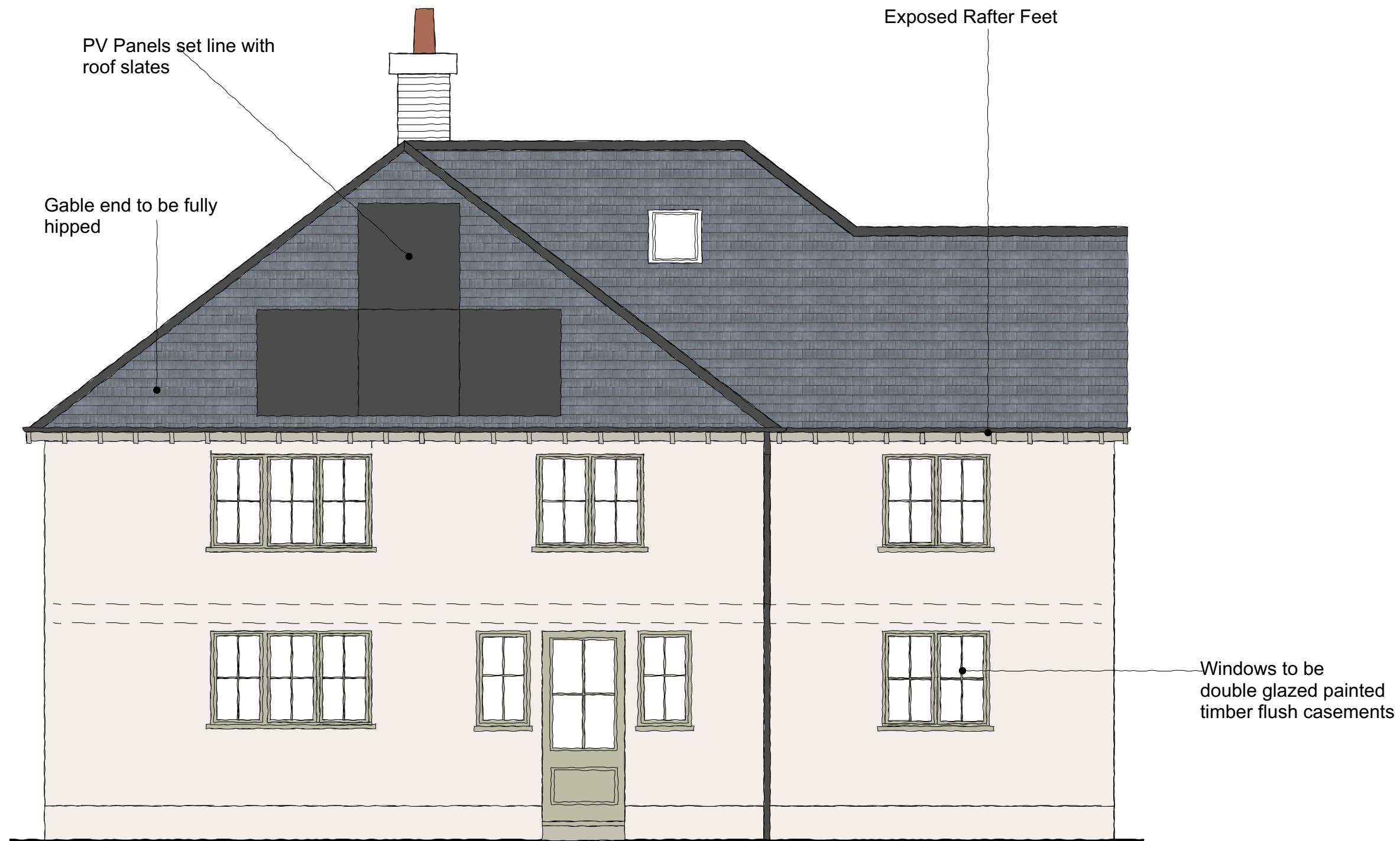
Rear Elevation Scale: 1:50