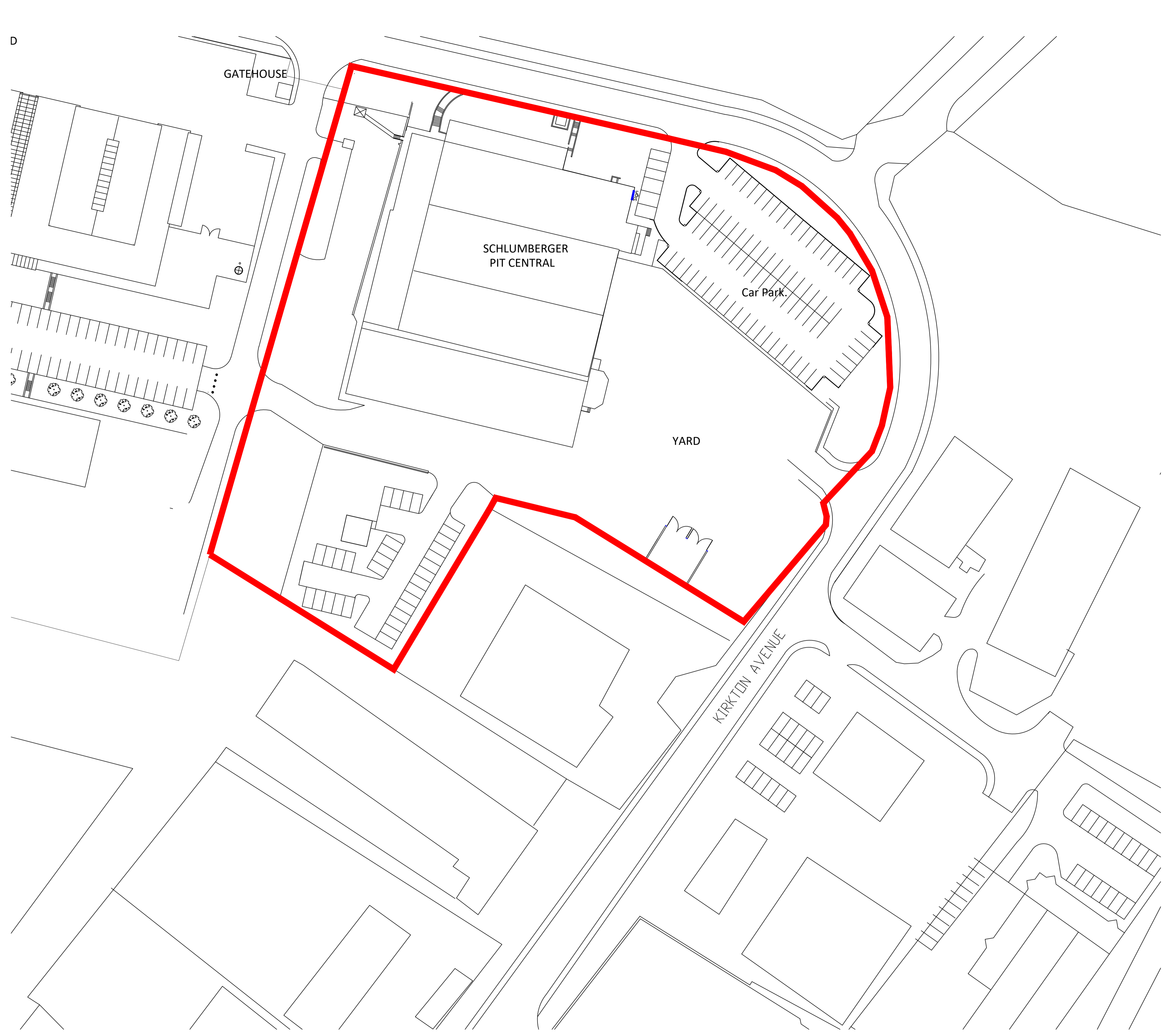
Site Plan - 1:500

— denotes approximate sign location — denotes site boundary