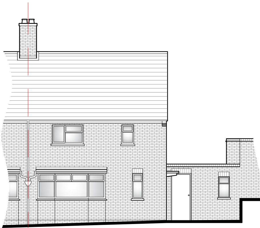
EXISTING EAST FRONT ELEVATION