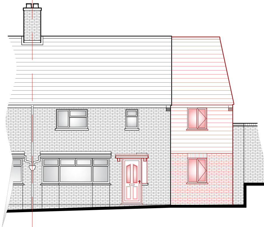
PROPOSED EAST FRONT ELEVATION