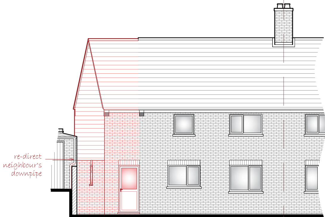
PROPOSED WEST REAR ELEVATION