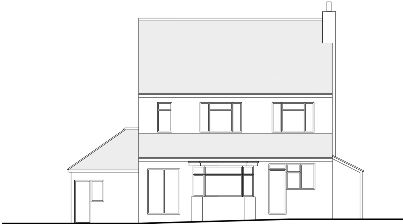
Rear Elevation scale 1:100