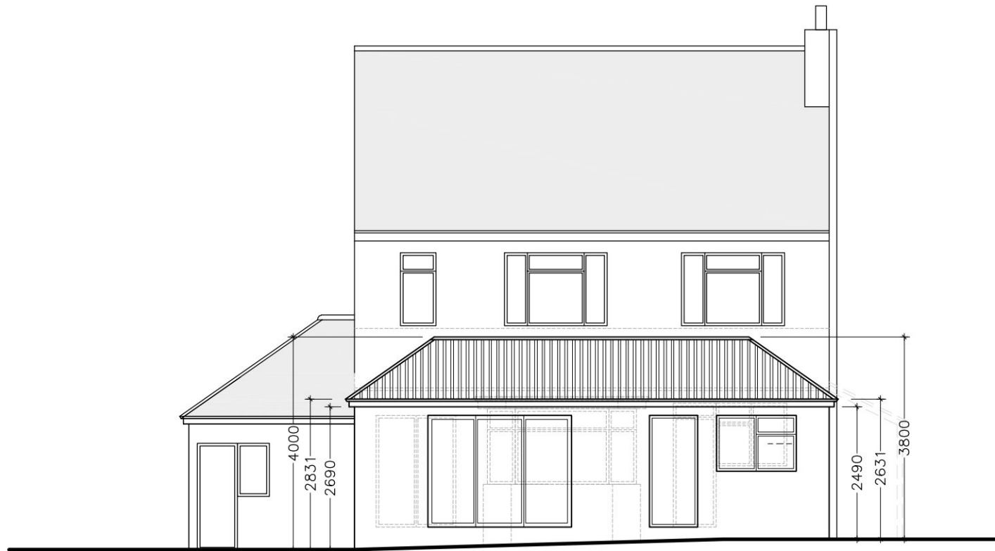
Rear Elevation scale 1:100