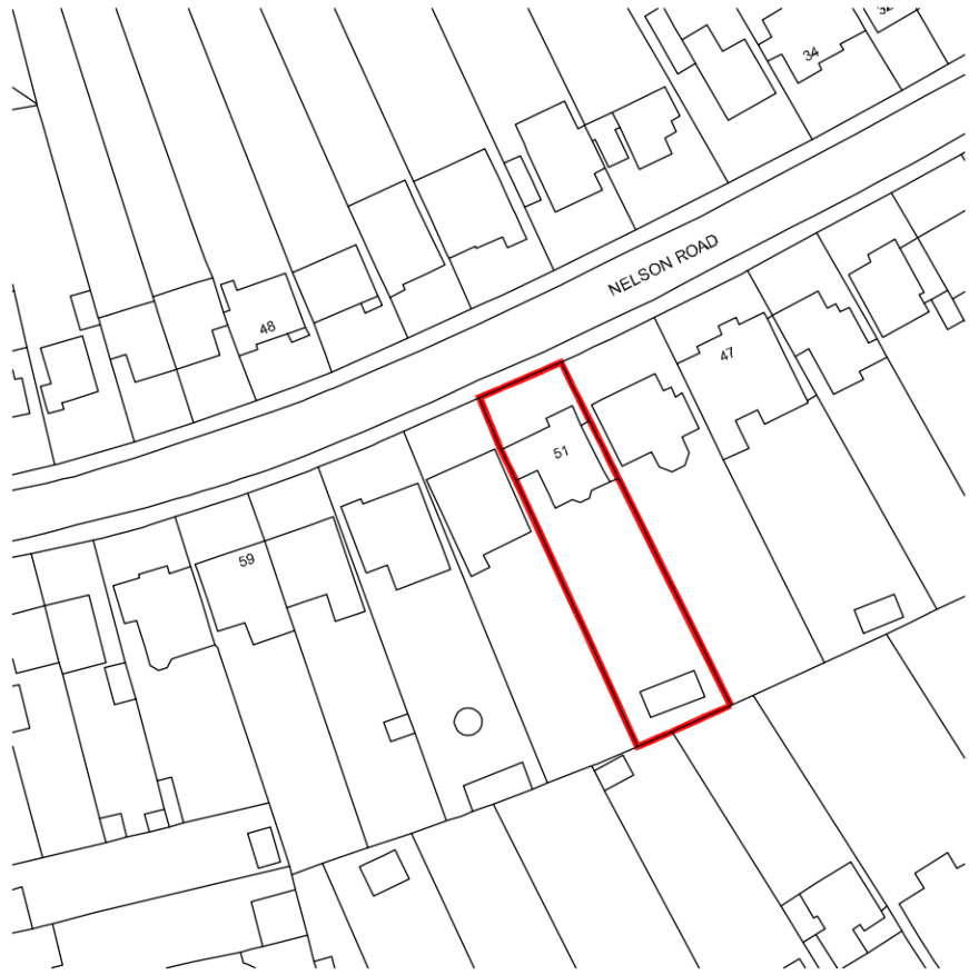
Location Plan scale 1:1250