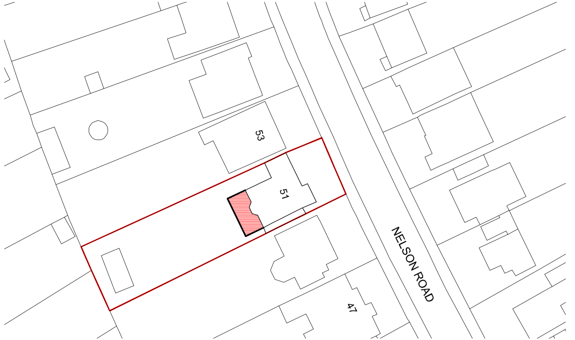
Site Plan scale 1:200