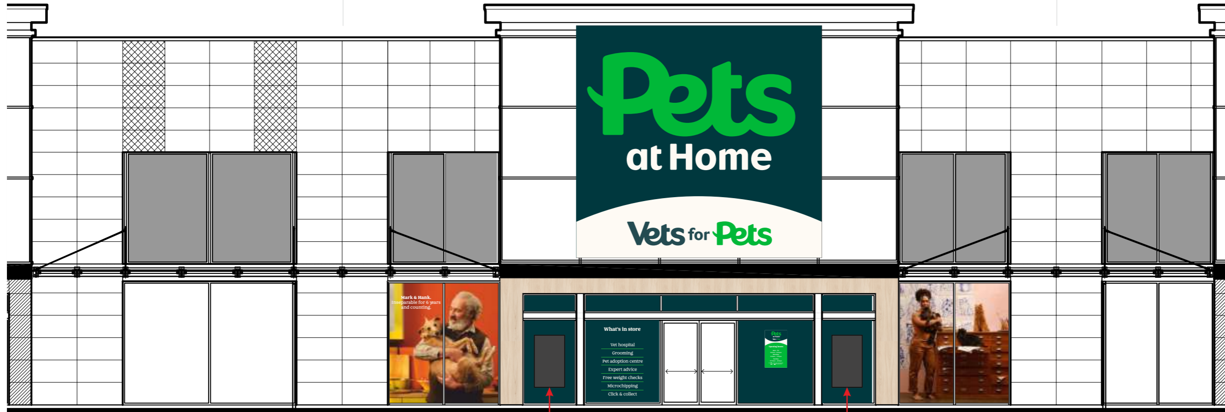
FRONT ELEVATION _ scale 1:100