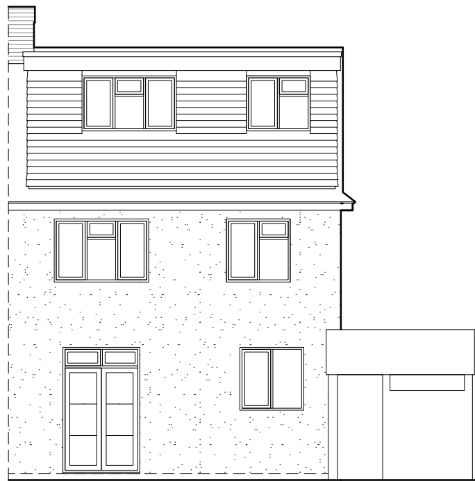
EXISTING REAR ELEVATION South facing