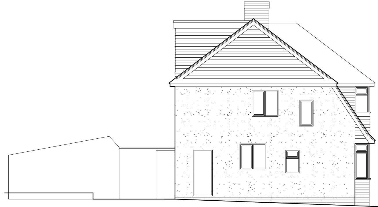
EXISTING SIDE ELEVATION East facing