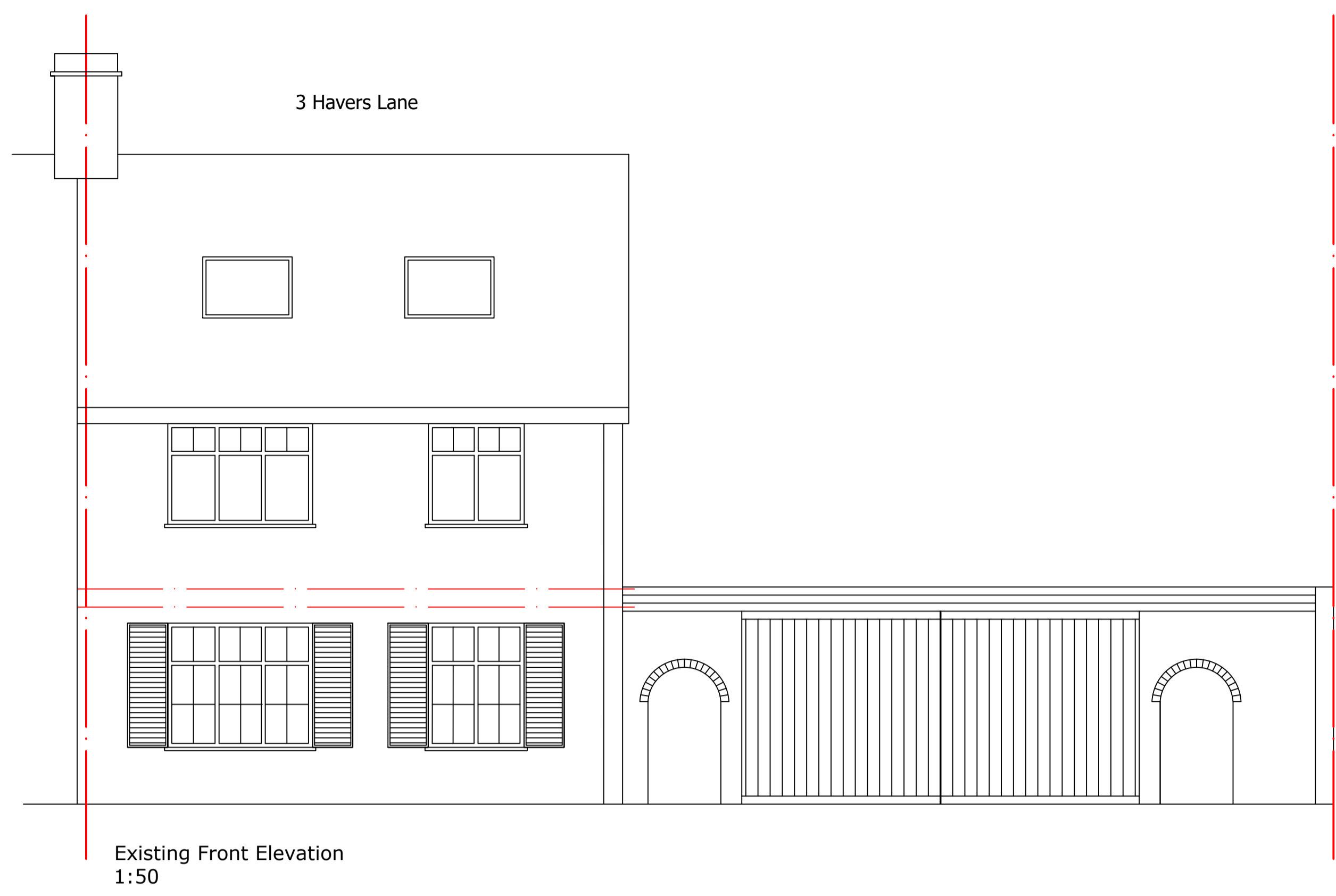
Existing Front Elevation 1:50