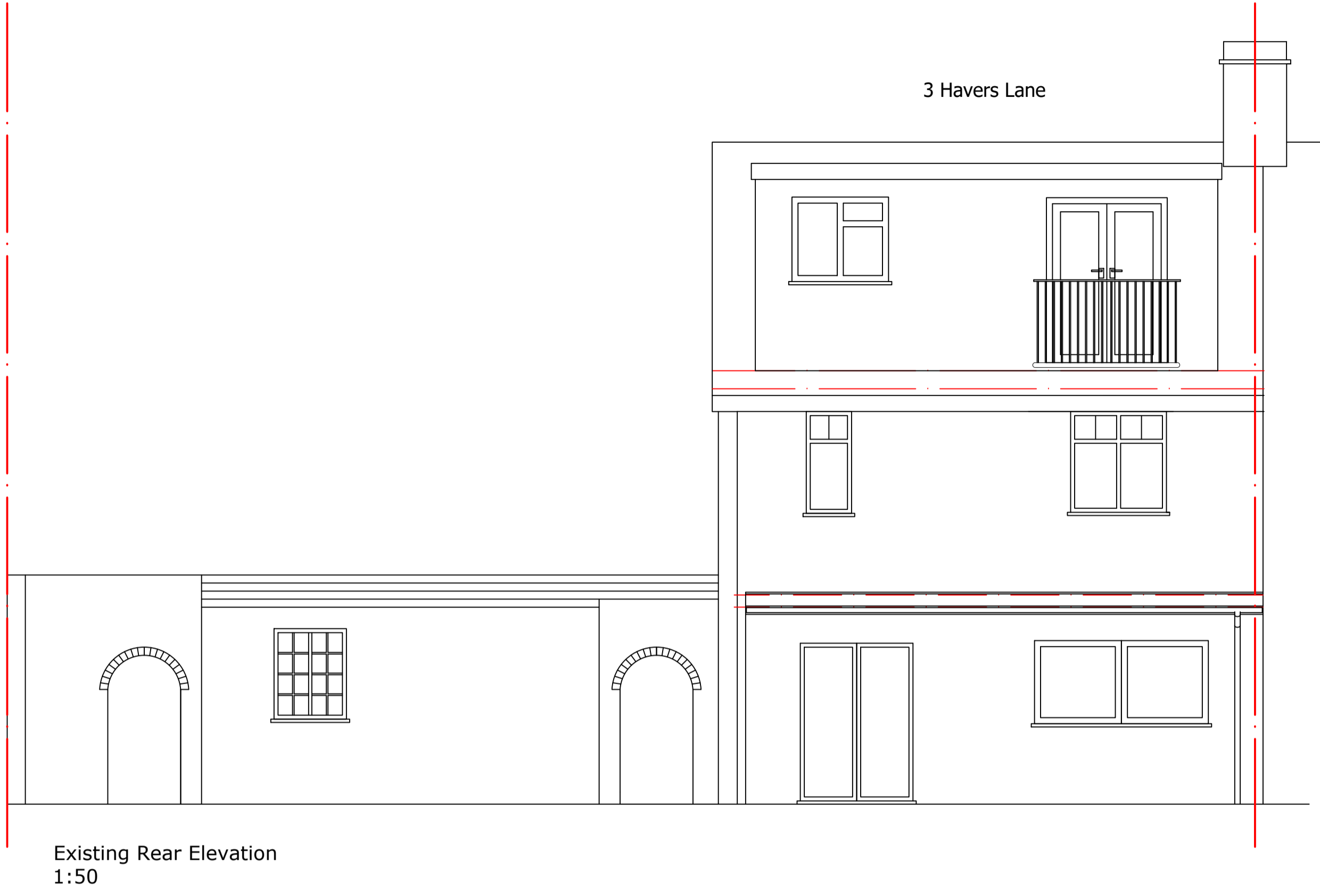
Existing Rear Elevation 1:50