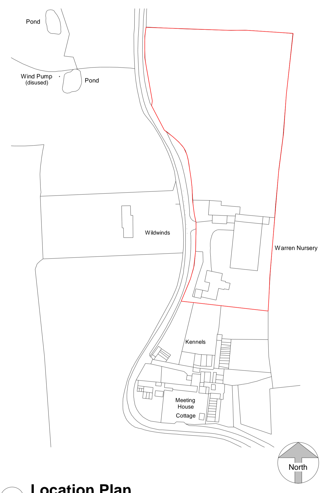
1 Location Plan 1 : 1250