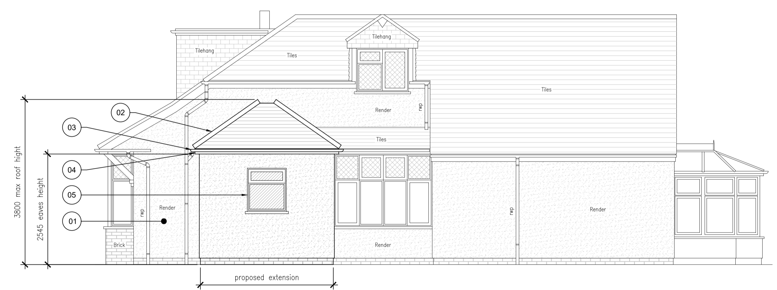
proposed right side elevation 1:50

materials schedule: 01 - white rendered wall in style to match existing. 02 - roof tiles in colour and style to match existing. 03 - black pvcu squareline guttering to match existing. 04 - white upvc fascia board to match existing. 05 - white upvc window with obscure glass in style to match existing.