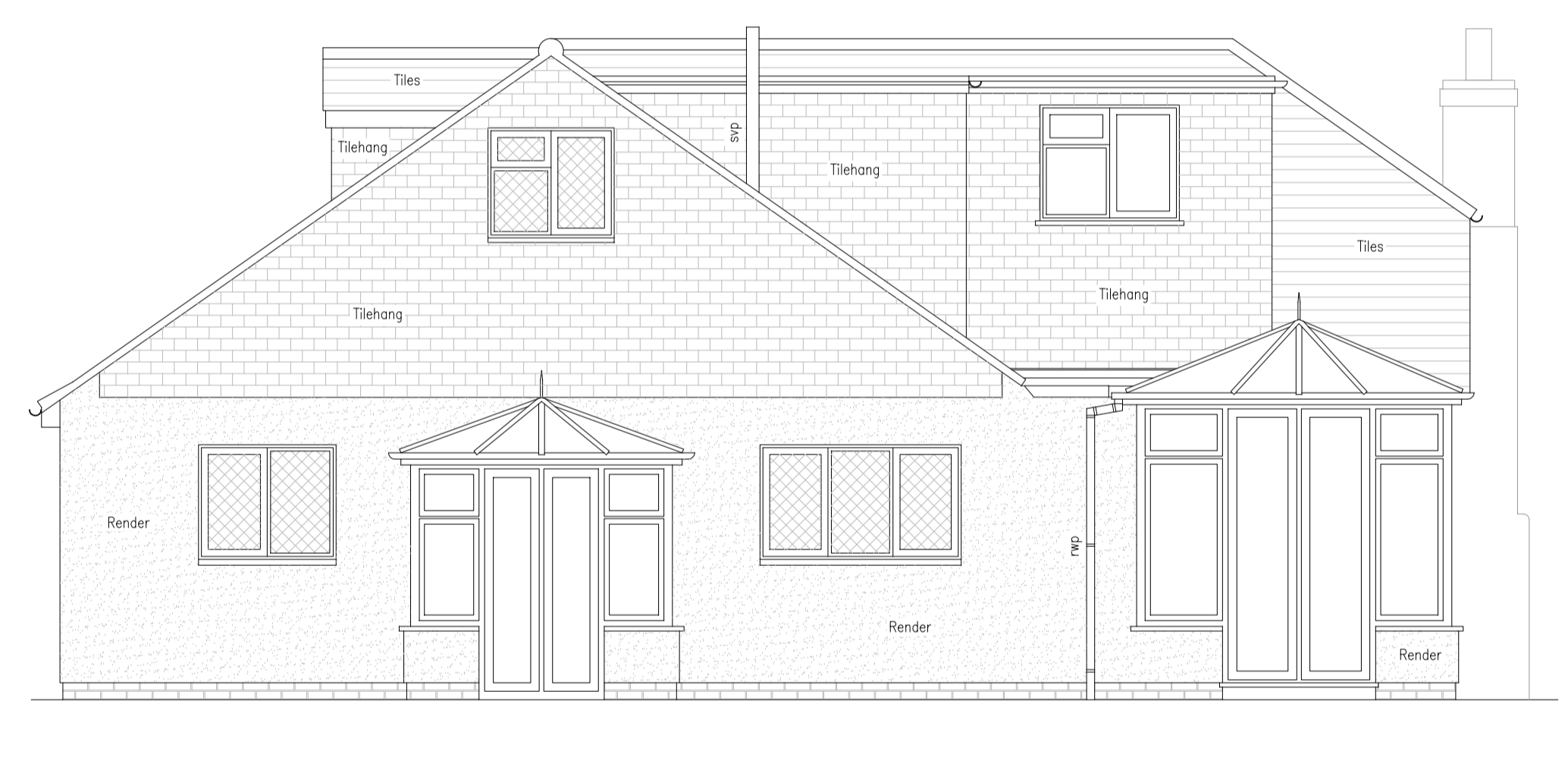
proposed rear elevation 1:50