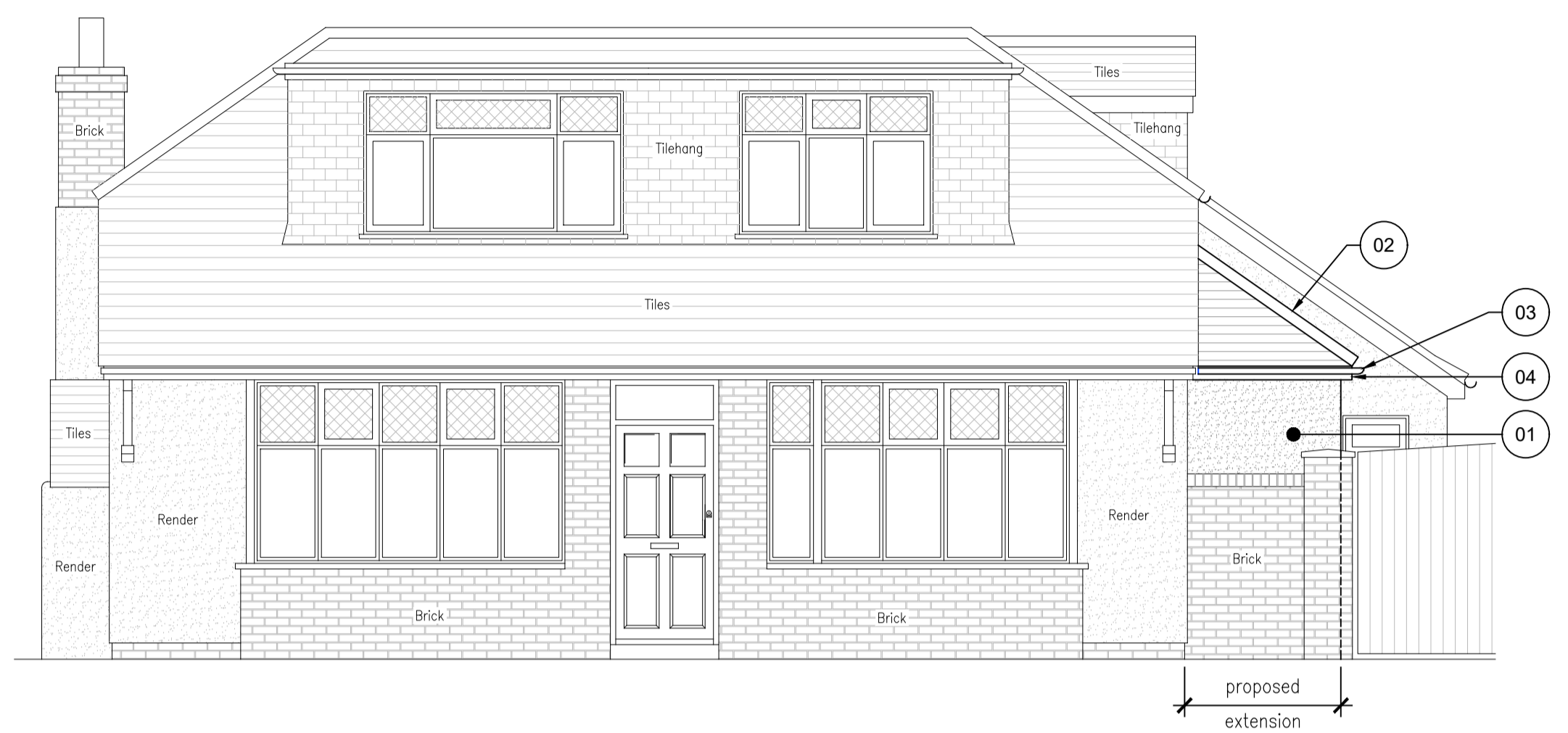
proposed front elevation 1:50

NOTES: © TS DRAWING SERVICES all dimensions have been site surveyed by use of tape/laser tape and are as approximate the contractor is responsible for checking all dimensions on site prior to the commencement of work. all works to be carried out the satisfaction of the local authority building inspector and in accordance with the latest nhbc standards.