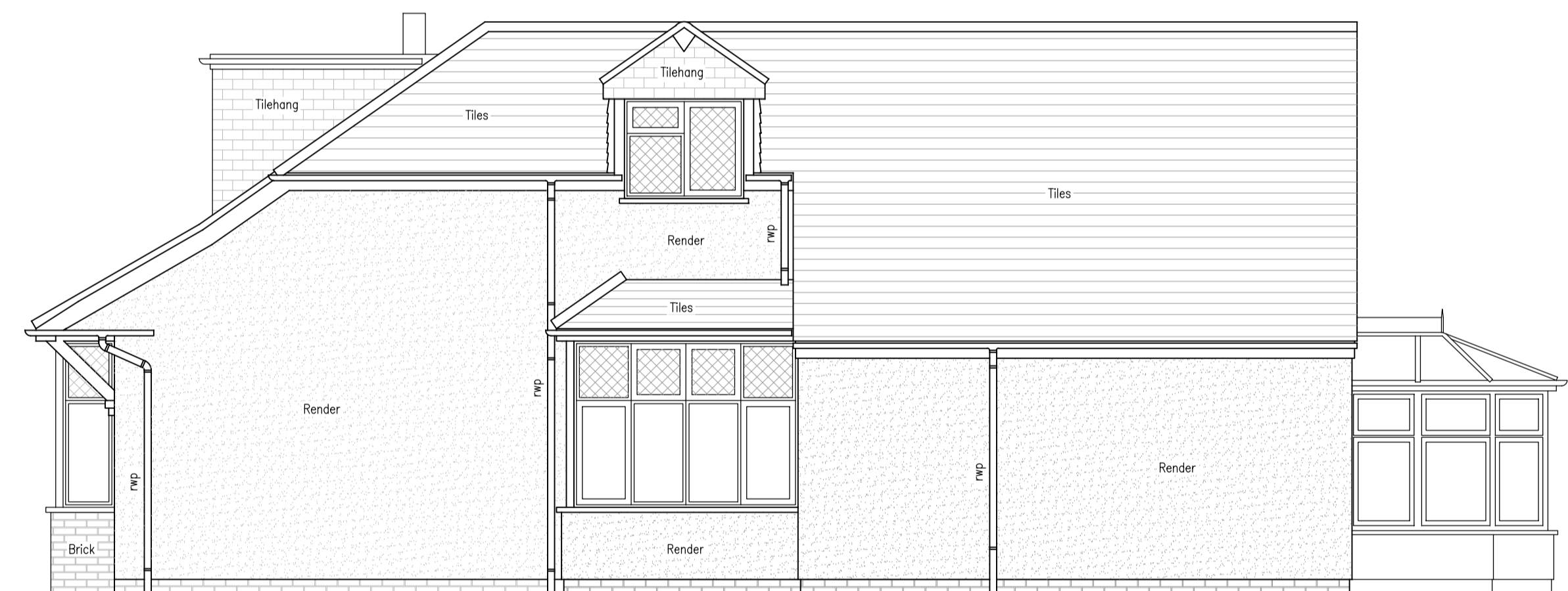
existing right side elevation 1:50