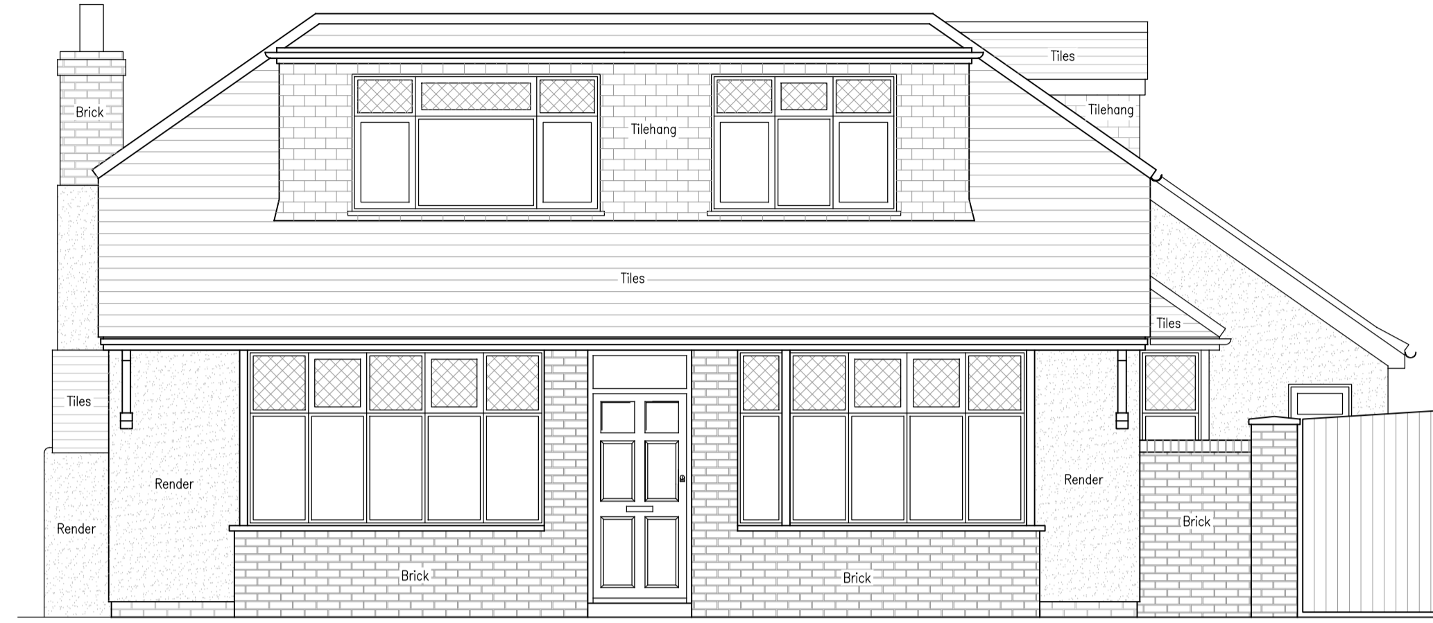
existing front elevation 1:50

all works to be carried out the satisfaction of the local authority building inspector and in accordance with the latest nhbc standards.