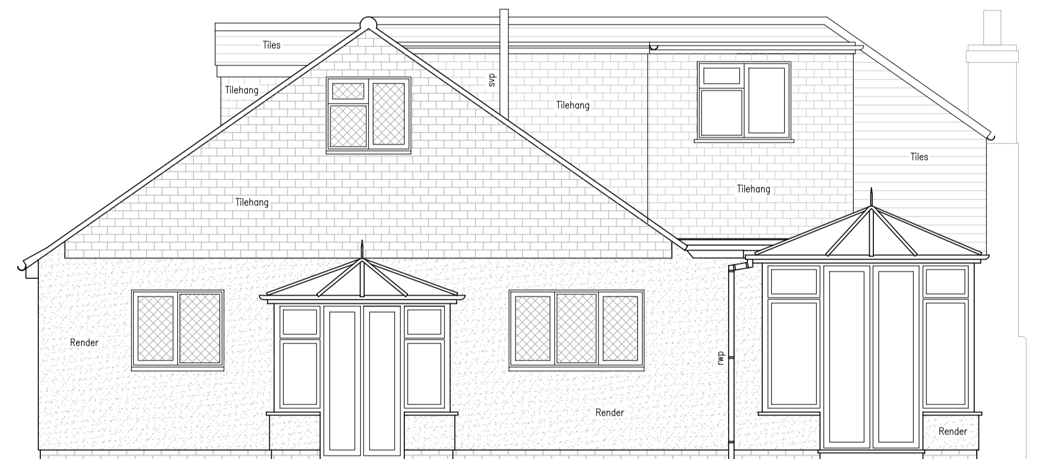
existing rear elevation 1:50