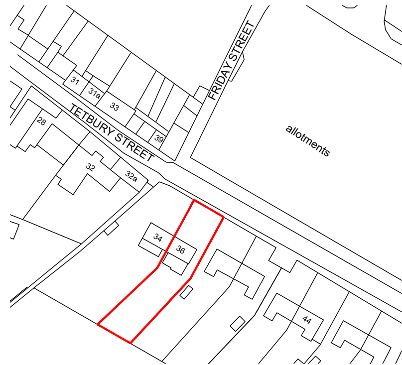
SITE LOCATION PLAN - 1:1250