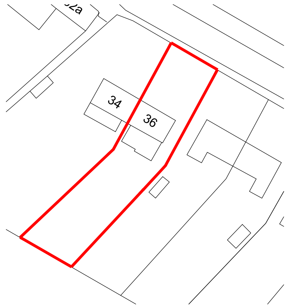
BLOCK PLAN - 1:500