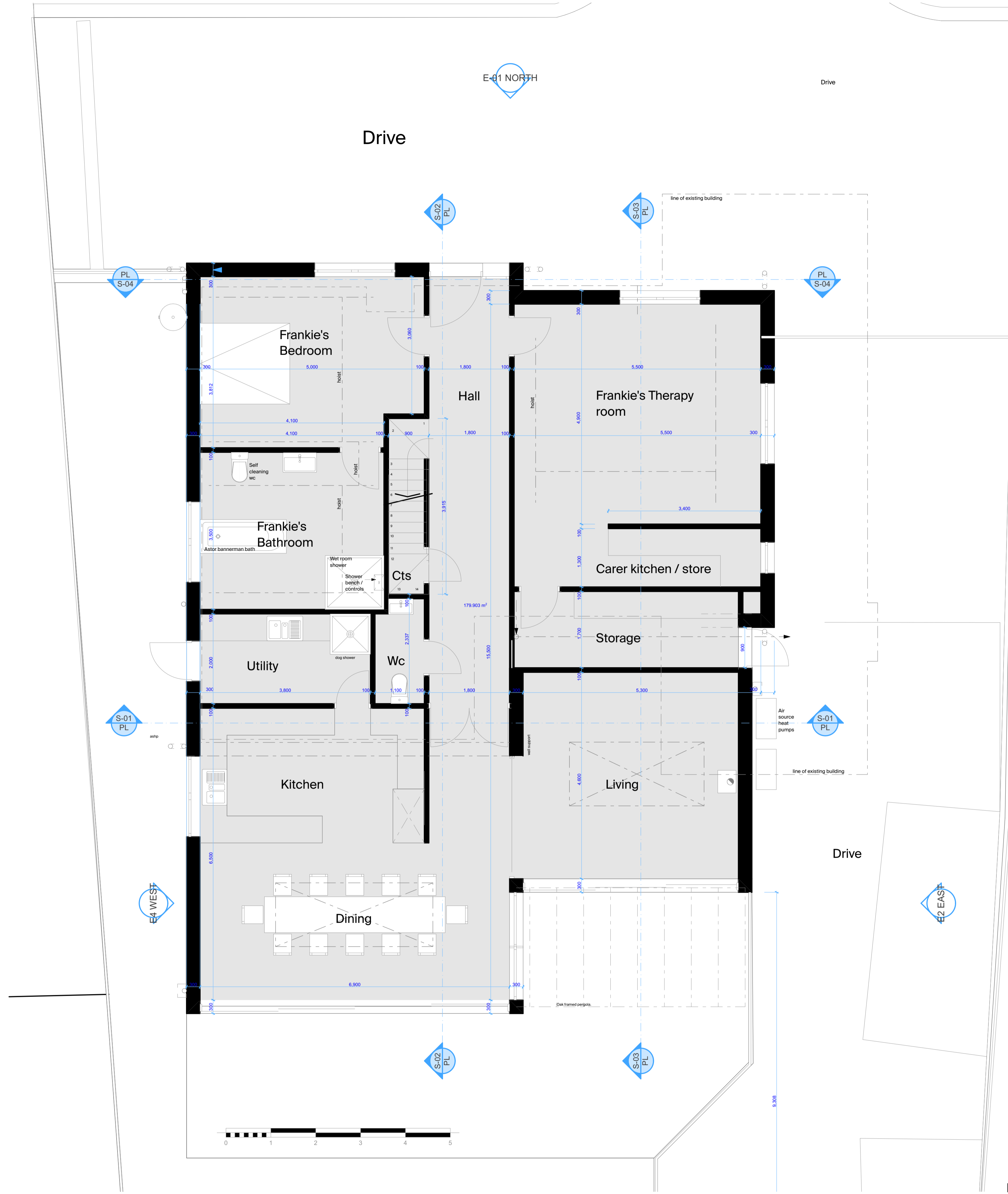
Ground floor plan – 1.50

Proposal to be read in conjunction with Arboricultural Impact Assessment completed by Talking Elm Tree Consultants.