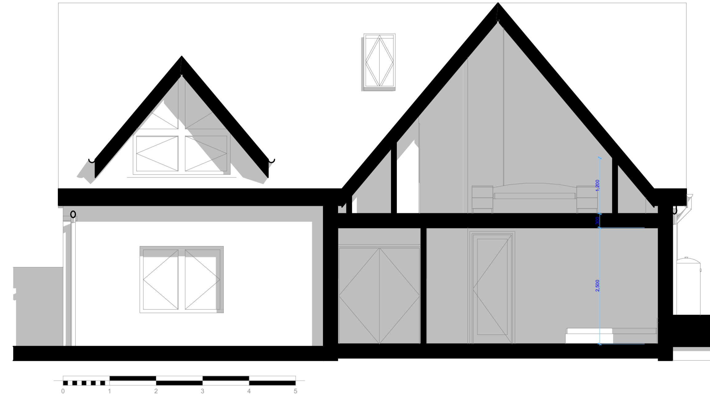
Section 04 — 1.50