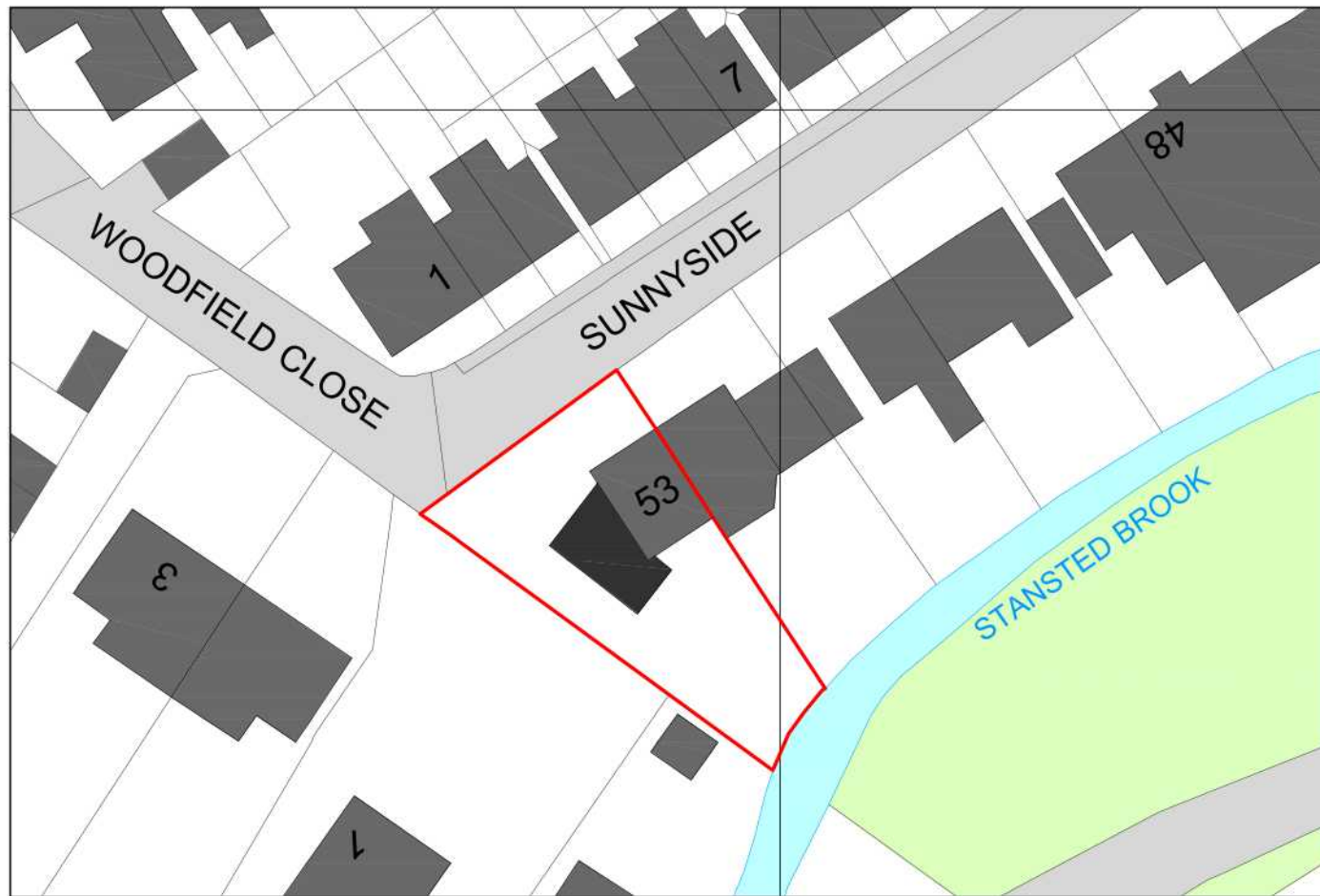
PROPOSED BLOCK PLAN - 1:500