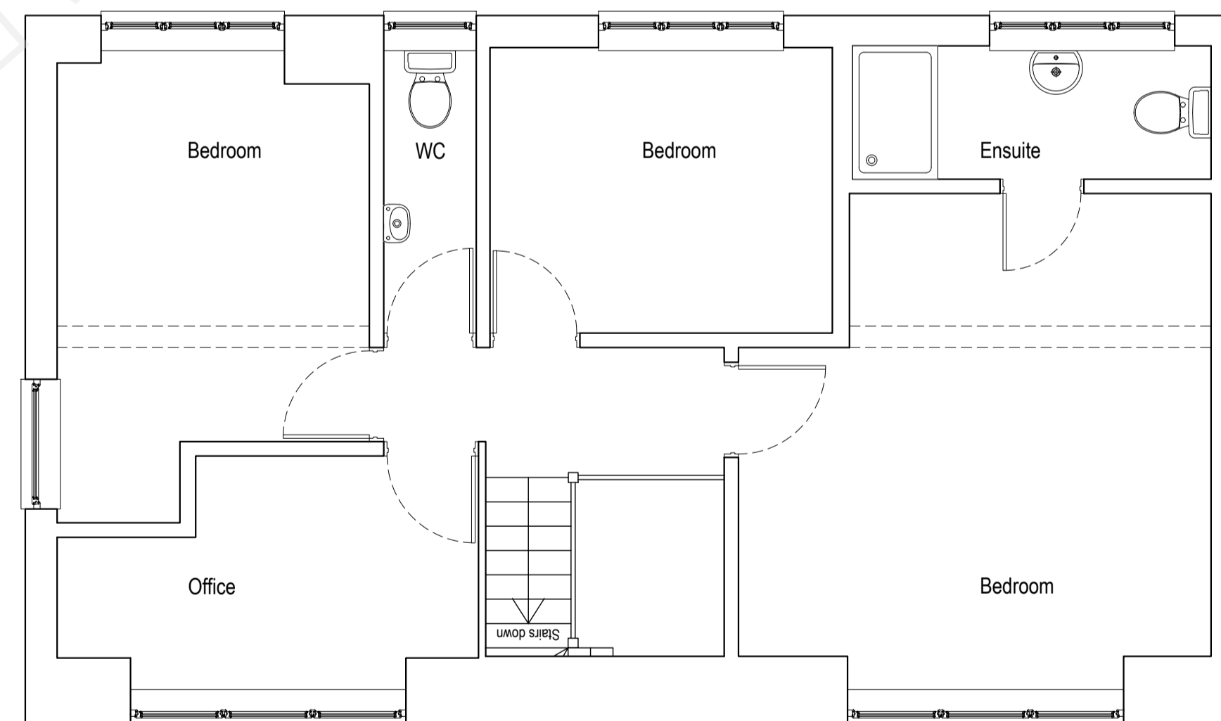
FIRST FLOOR PLAN 1:50