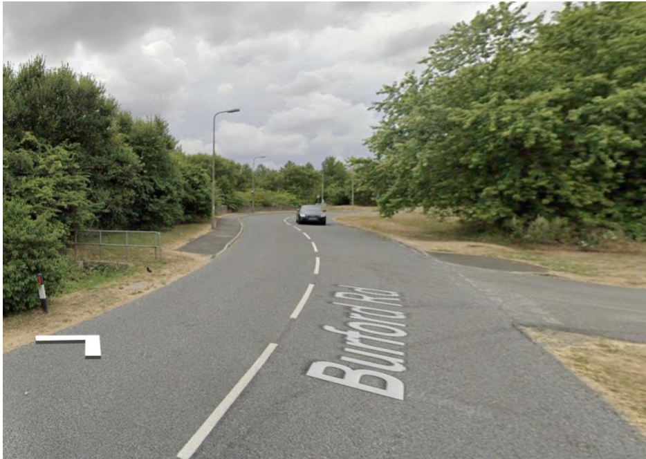
Prohibited parking on the Burford Road for construction traffic