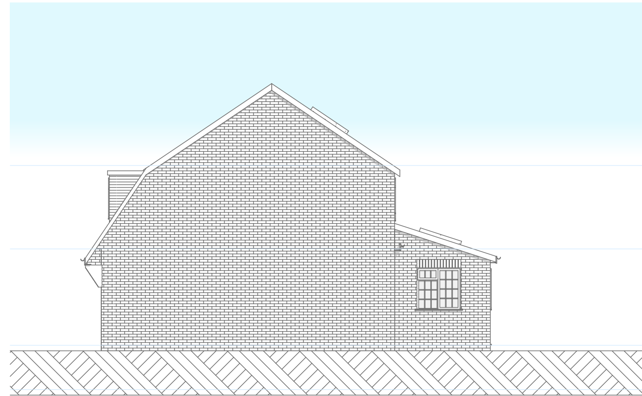
Existing Side Elevation E 1:100