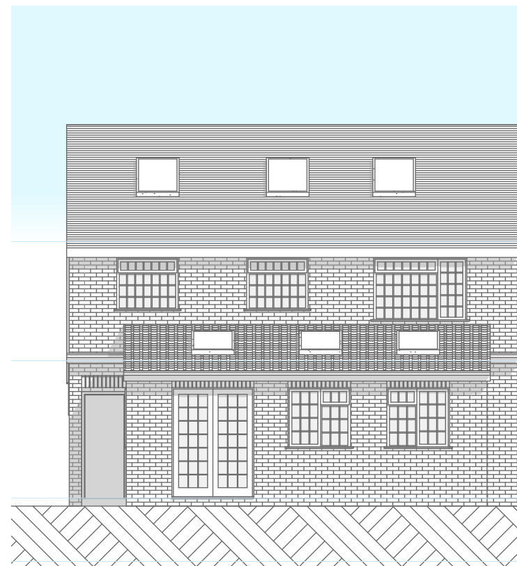
Existing Rear Elevation 1:100