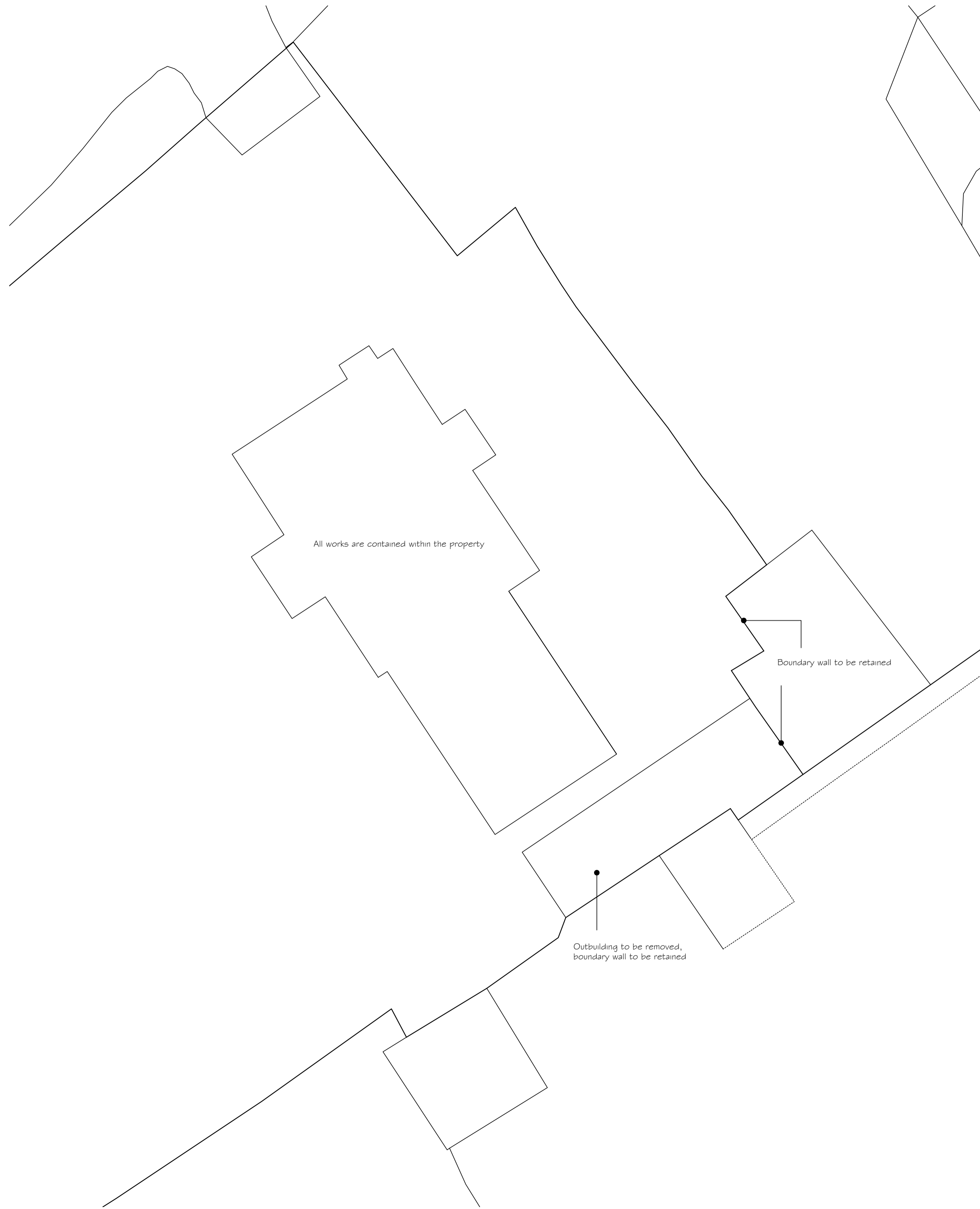
Site Plan 1:100 @ A1

This is a scaled drawing for planning purposes. Contractor to check all dimensions on site prior to the commencement of the works.