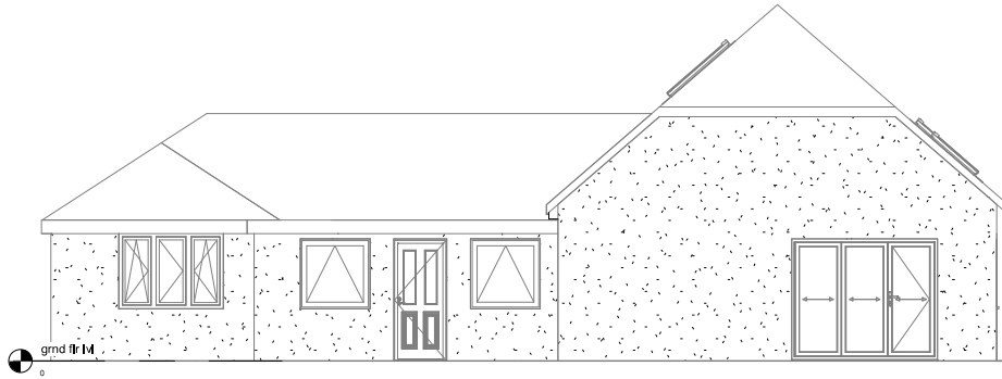
Proposed Elevation-Right side