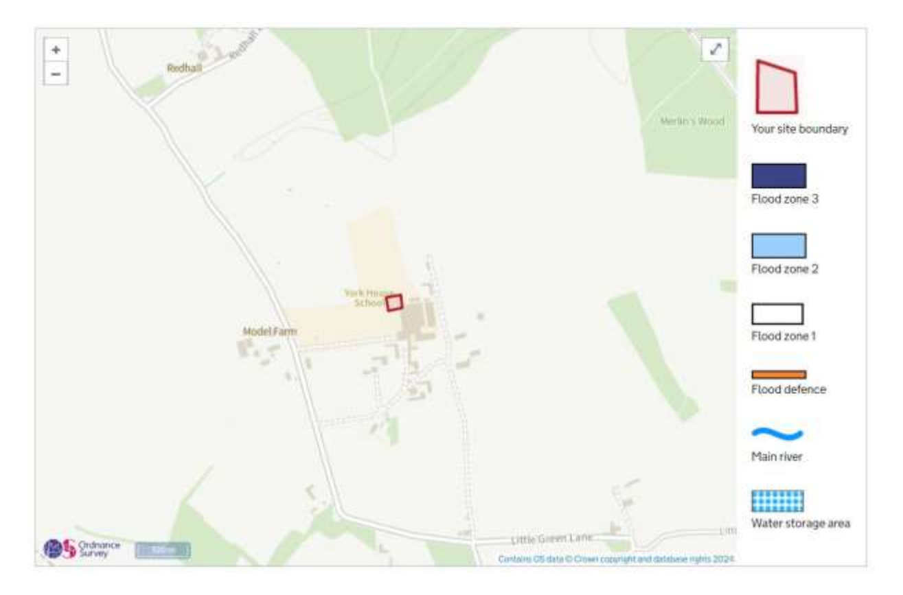
Environment Agency Flood Risk Map - Zone 1

4.4 The site of the proposed building is designated in flood risk zone 1 by the Environment Agency.