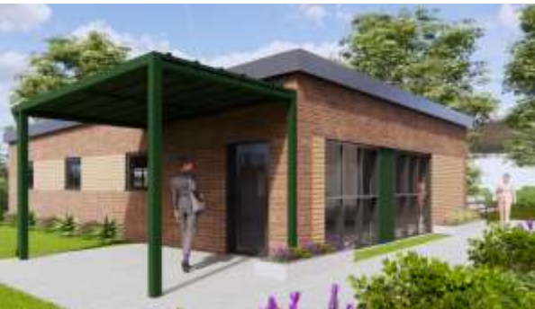
Artist Visualisation – North Elevation