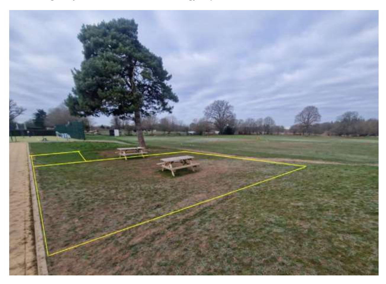
Site Photo - Indicative Location Plotted in Yellow

4.3 To west of the proposed building is a single pine tree, which is proposed to be retained. The building is proposed to the east of the tree with an entrance canopy area to the south. A survey and tree protection plan are included in the submission.