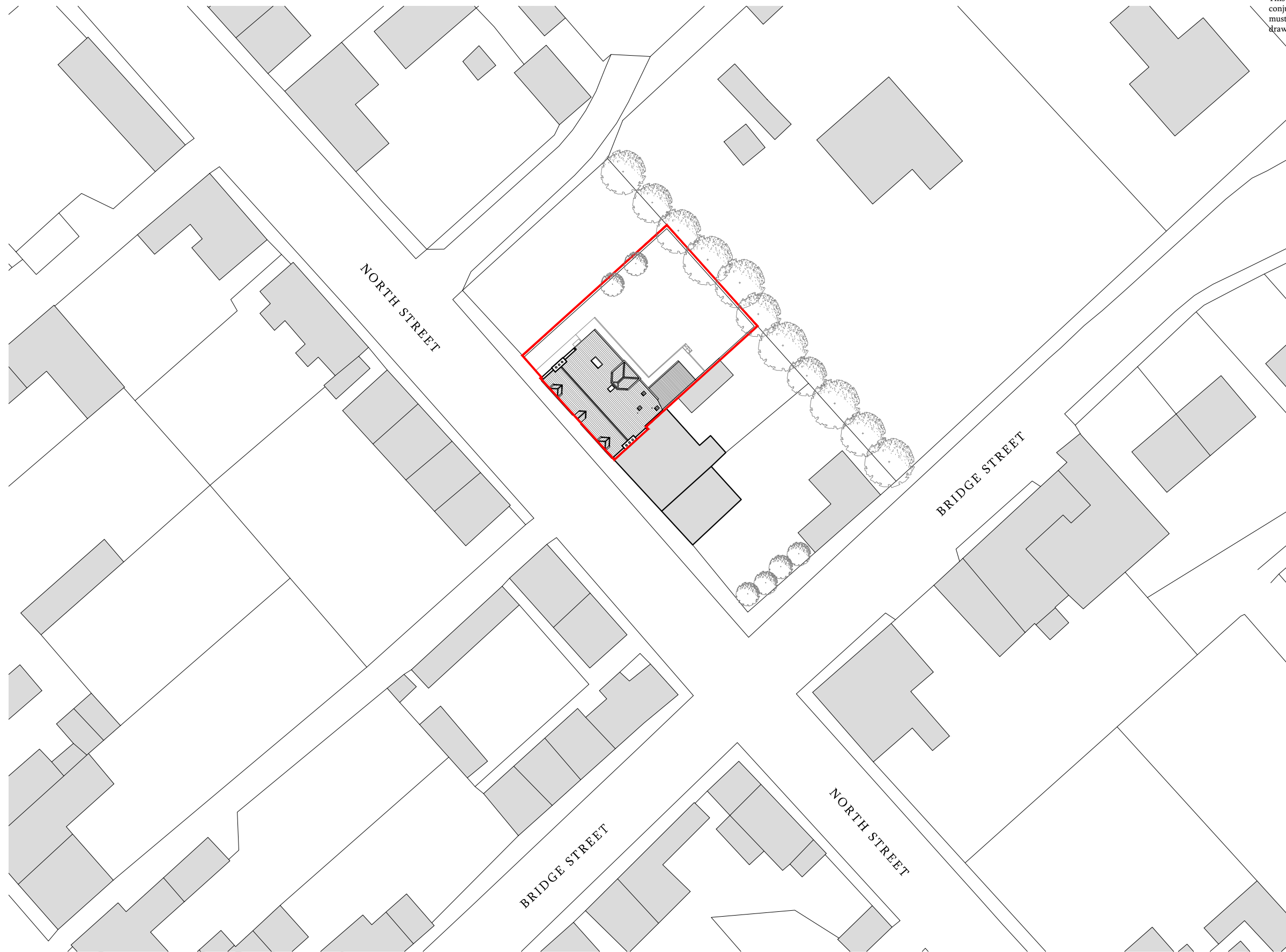
Existing Site Plan 1:500

This drawing is copyright of Annie Kenyon Architects Ltd. This drawing is to be read in conjunction with all related drawings. Do not scale from this drawing. All dimensions must be checked and verified on site before commencing any work or producing shop drawings. The originator should be notified immediately of any discrepancy.