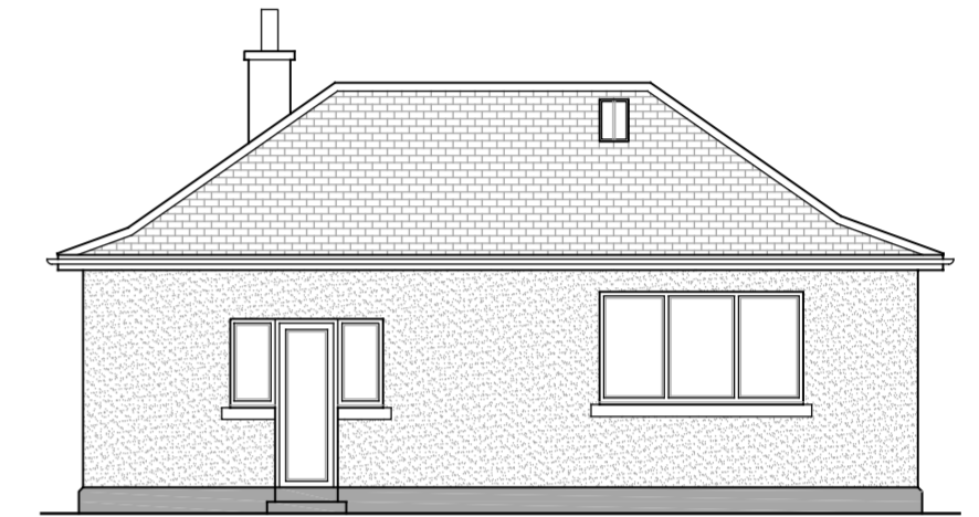
East Elevation : Scale 1 : 100