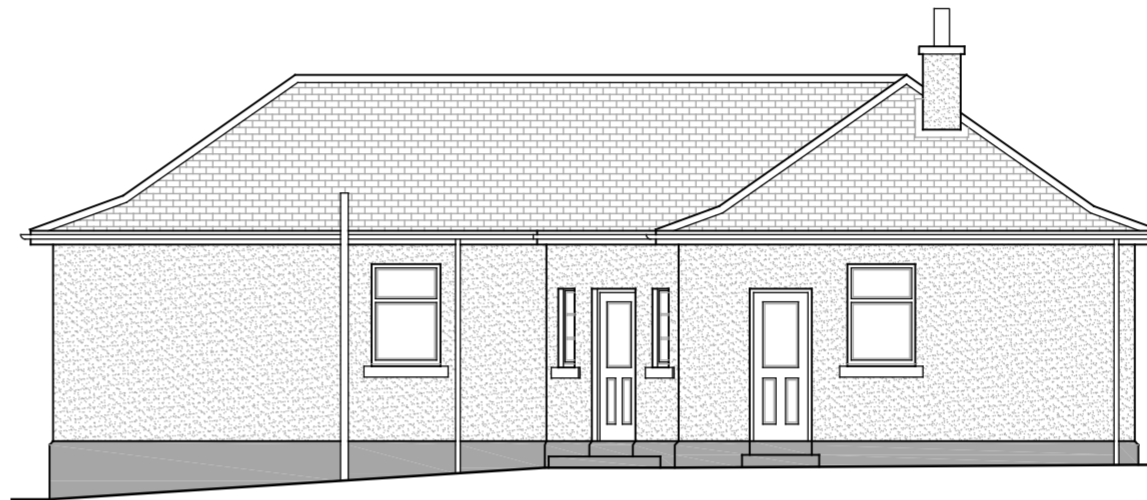
South Elevation : Scale 1 : 100