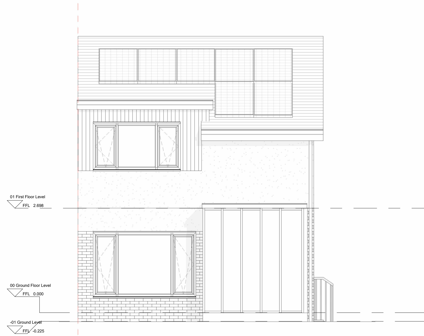
Front Elevation - Existing 1 : 50