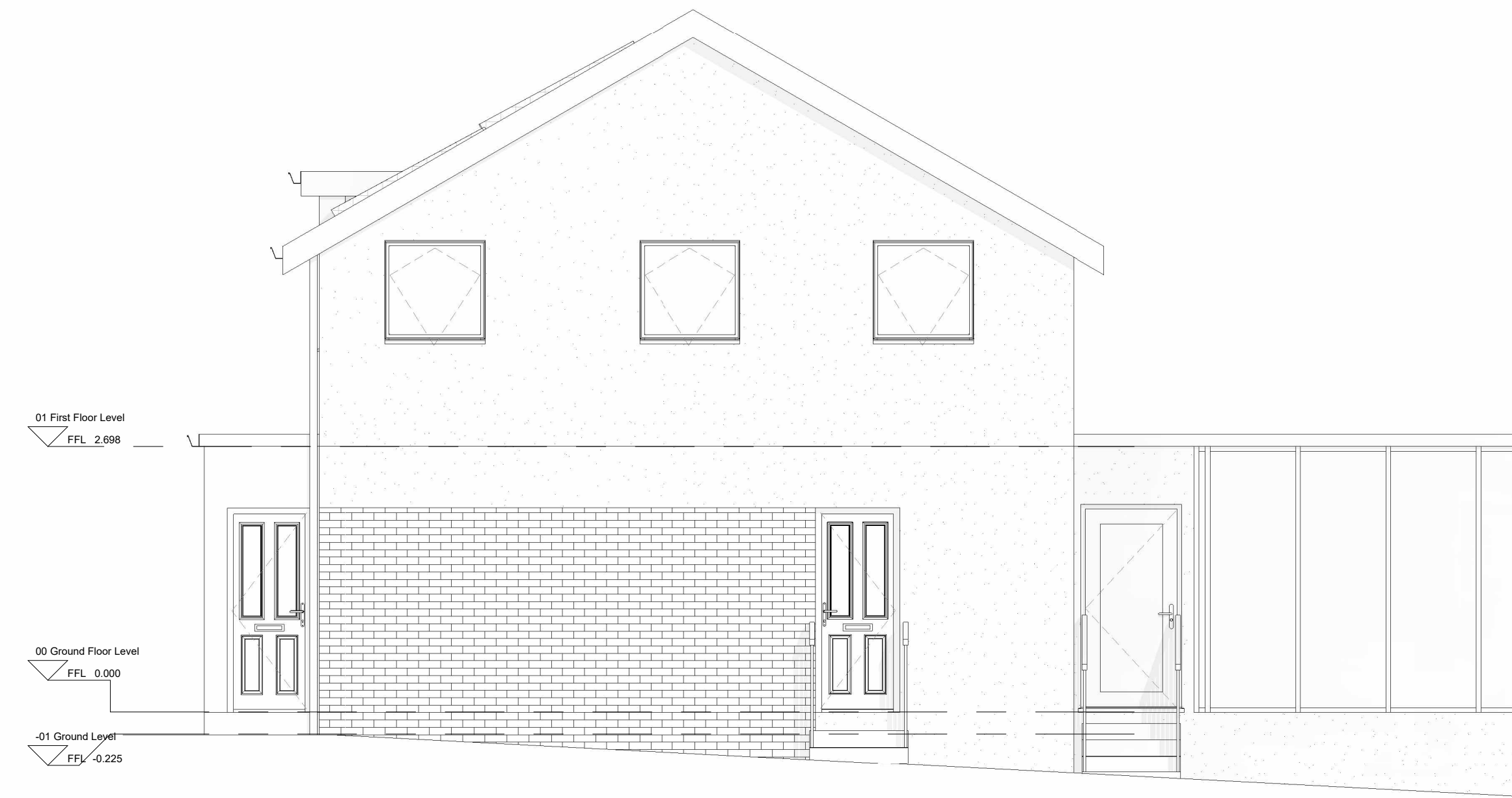
Gable Elevation - Existing 1 : 50